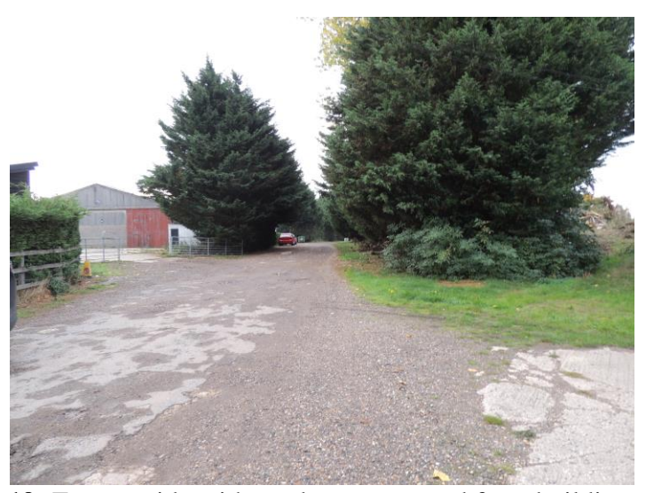
Photo 19: Eastern side with road to cattery and farm buildings to left