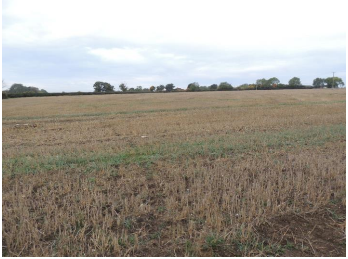
Photo 21: Looking westwards. The mammal path is used by fallow deer (droppings were present)