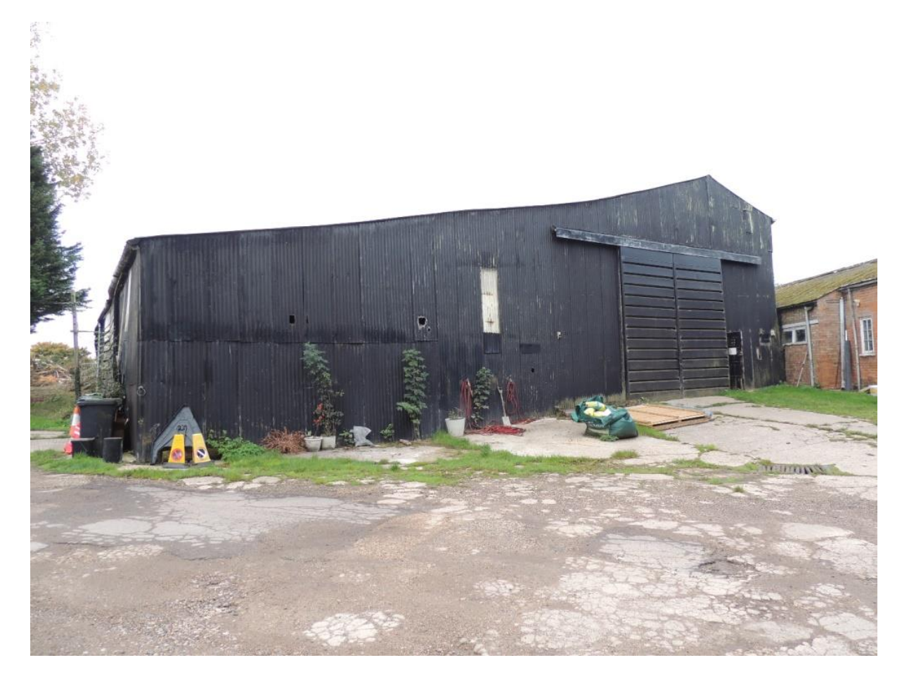
Photo 1: Front (northern) elevation. Note hardstanding. The proposal involves replacement with a residential dwelling

As part of a planning proposal involving a barn at Duck End Farm, Lindsell, Dunmow, Essex CM6 3QH, a site visit was conducted on 12<sup>th</sup> October 2022 to determine whether the site had the potential to be occupied by protected species, which would be affected if any proposed development were to go ahead.