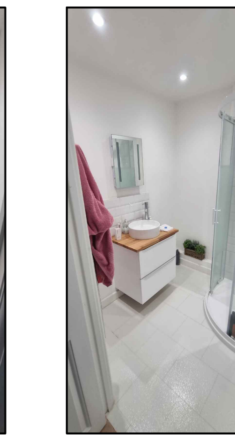
View 4 in En-Suite 1