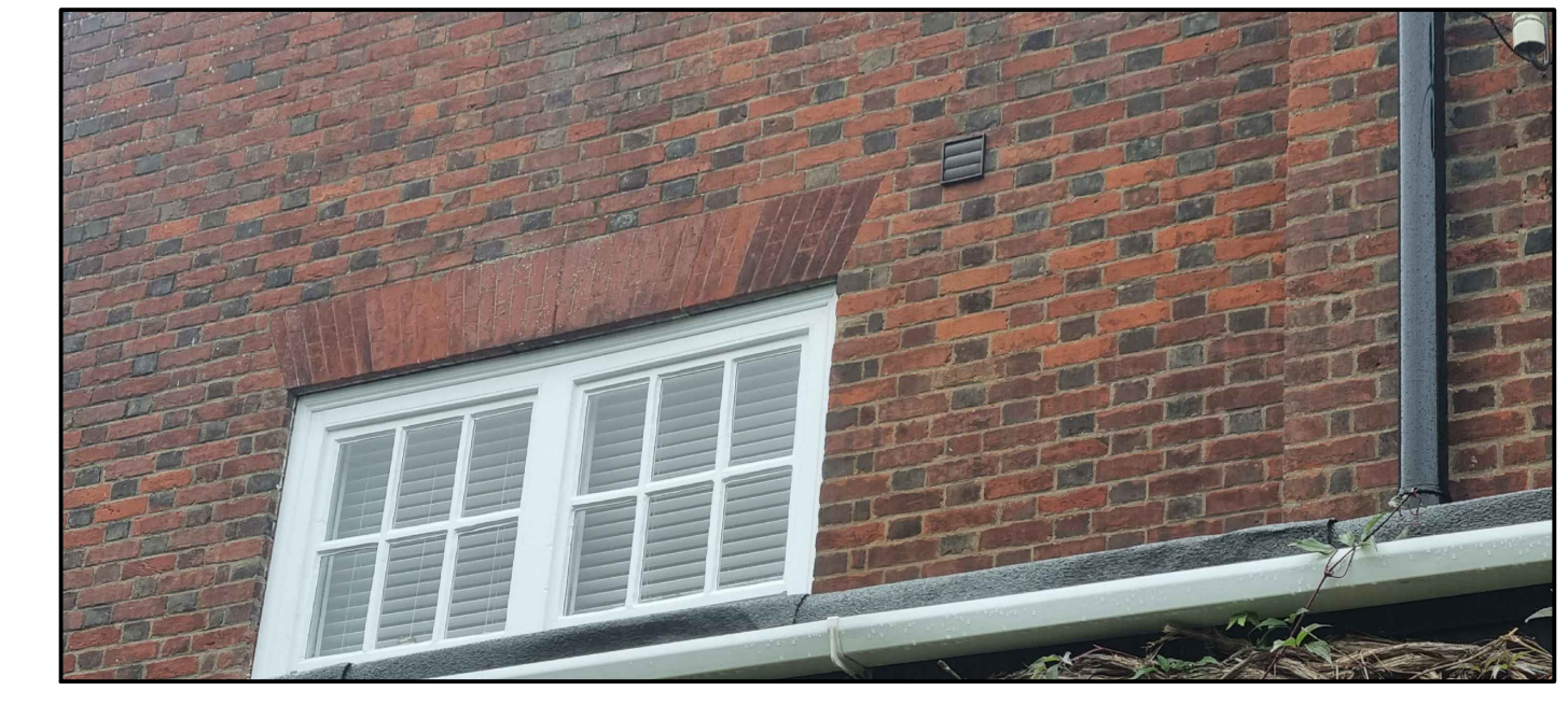
View 5 - Extract grill from En-Suite 1