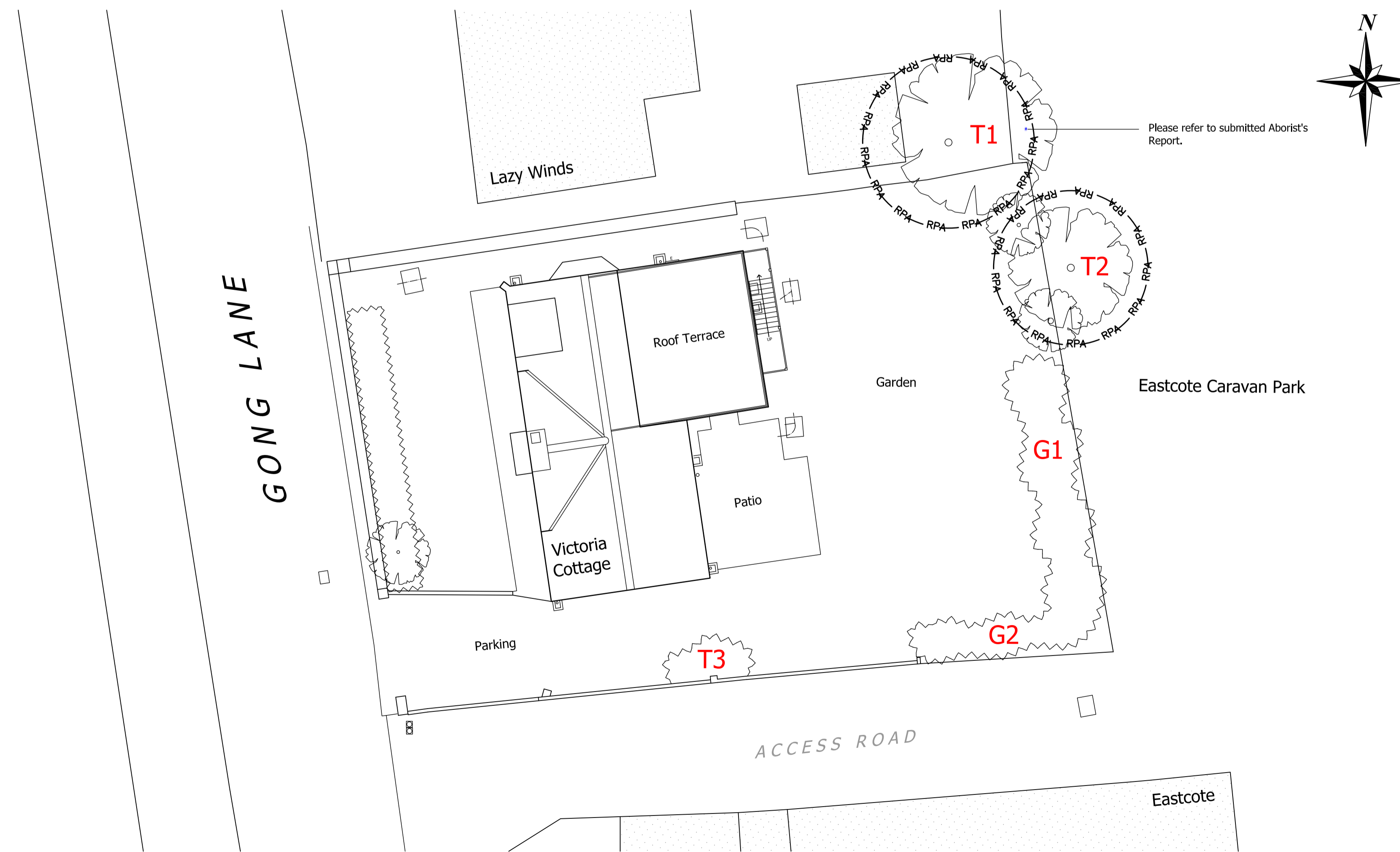
Site Plan 1:100