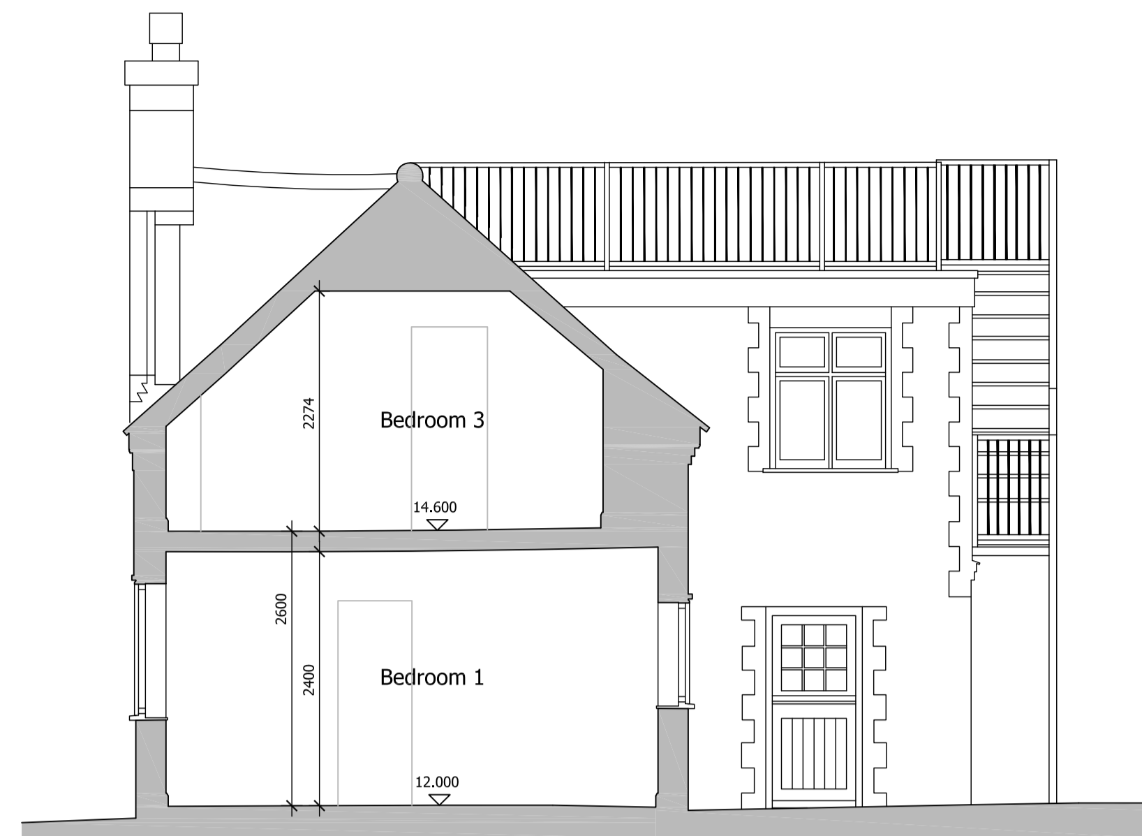
Section A-A 1:50