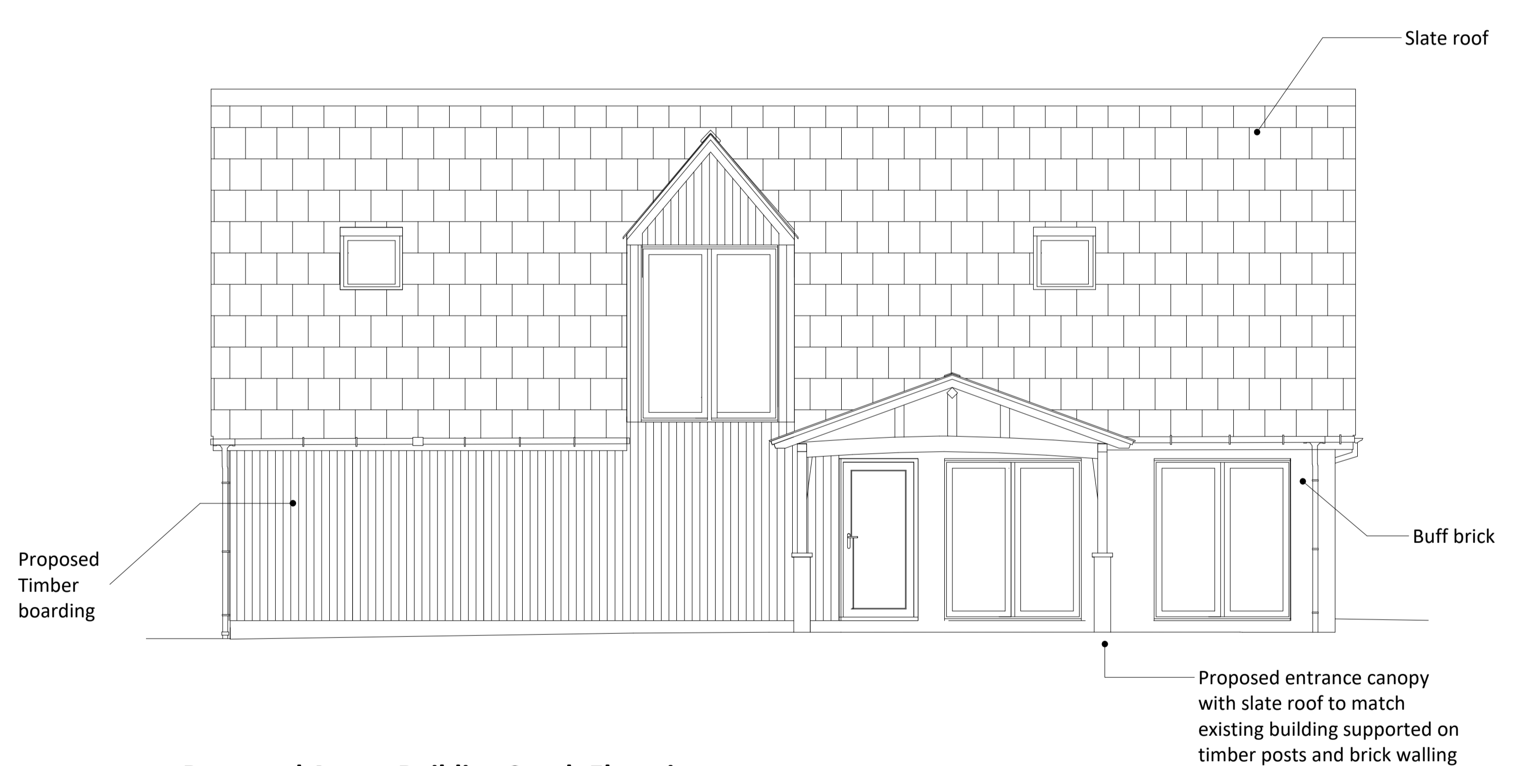
4. Proposed Annex Building South Elevation SCALE - 1 : 50@A1