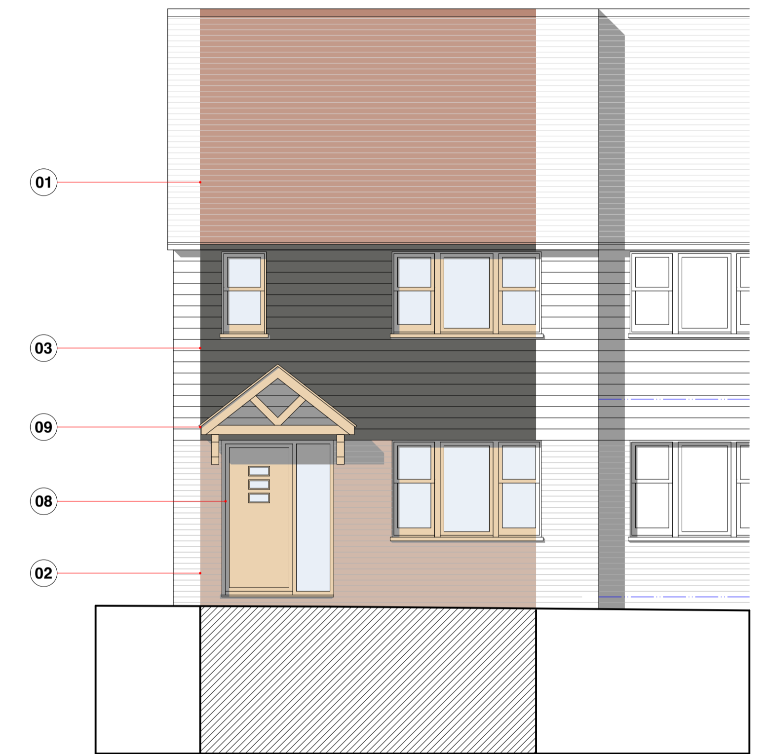
C_UNITS 05 & 06: SOUTH WEST ELEVATION