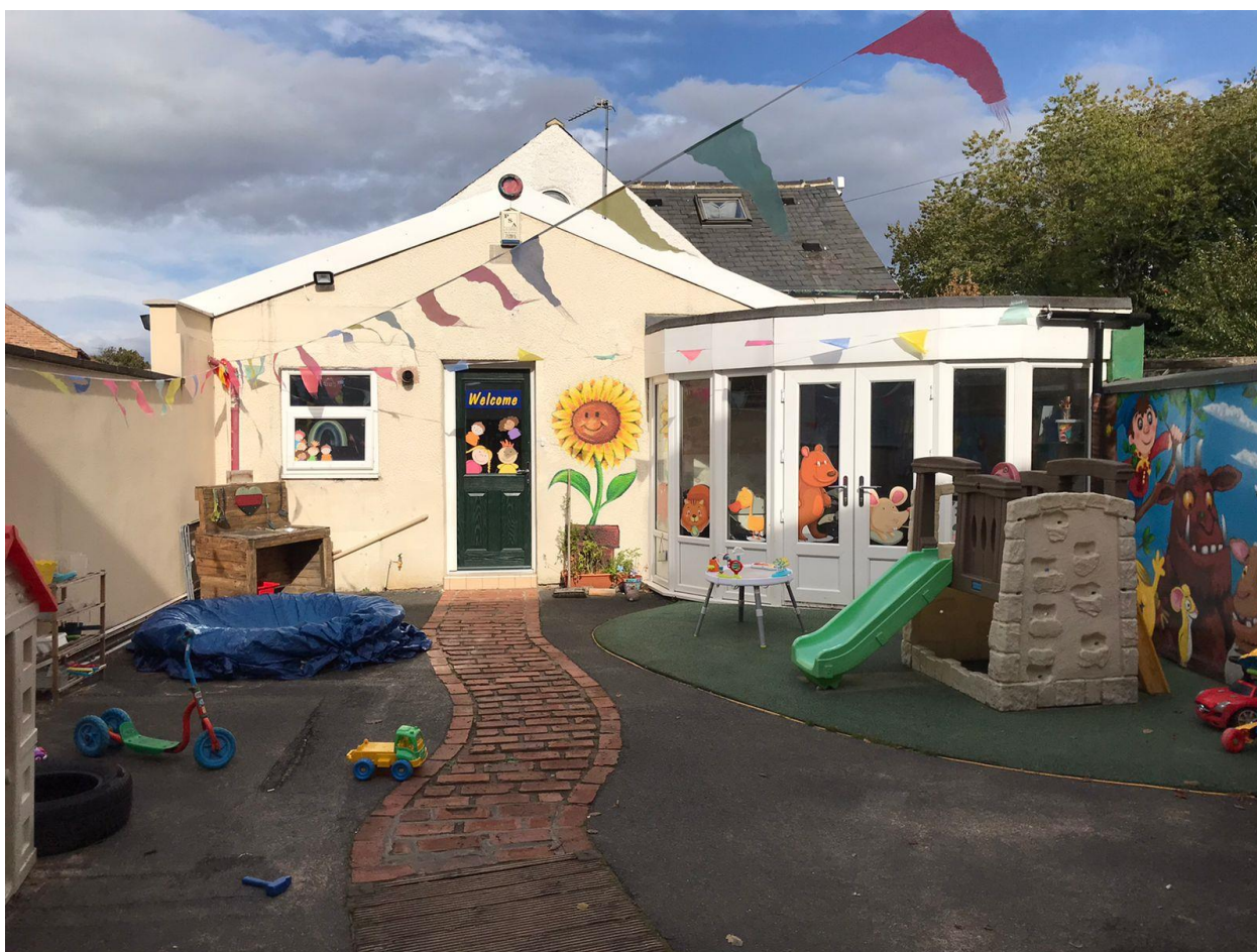
Photo of Recent Extensions to the South Elevation of the Old Dairy

The Old Dairy is a detached building to the north of the Old House, that is part in the ownership of the client being occupied by the client's mother and the other part of this building being used by the nursery. It is identifiable on the 1 st edition OS map circa 1856 and is likely to be considered as a non-designated asset despite its current appearance to the south and east elevations.