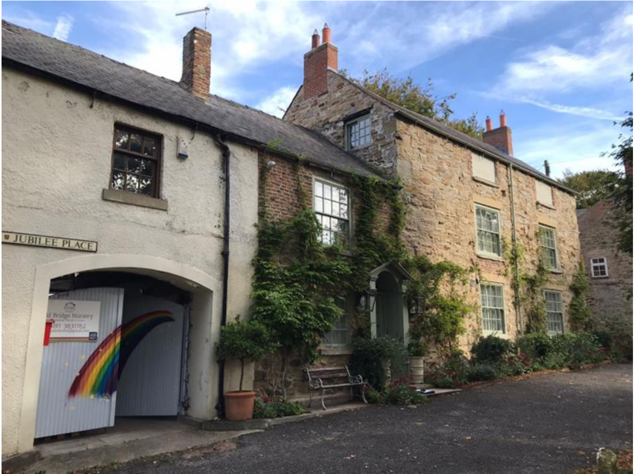
Photo of the Southern Elevations of Nursery and the Old House