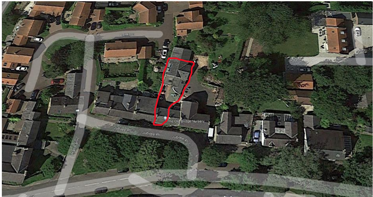
Satellite Image Showing Site Location and the Immediate Surroundings