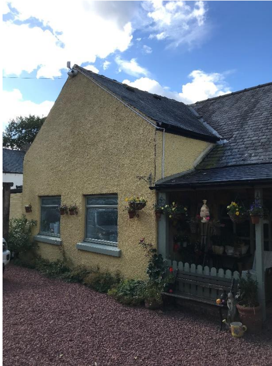
Photo Showing East Elevations and the Windows that are to be Blocked

The Old House is a stone building with natural stone heads and cills with a natural slate roof finish. There is a small element of the house that also has its original brick exposed. The windows are timber sash painted green. The nursery building fronting Jubilee Place is rendered but does have timber windows painted brown and a slate roof. Currently, there is an arch, however, it is considered that this is not the original arrangement and the client has provided an old image of what is thought to be the original arrangement, which consists of a window and door. The Old Dairy is an array of wall finishes, including render to the east and west, full height PVC conservatory to the south and a mixture of stone and brick to the west with a brick gable to the north.