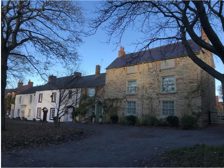
Photo of Wider Street Scene of Jubilee Place