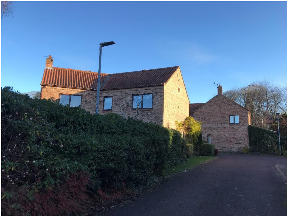
Typical Arrangement on Hall Farm