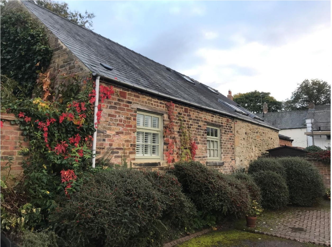
West Elevation of The Old Diary

The street scene of Jubilee Place and High Street is made up of similar type building as described of varying heights and ridges with a mixture of wall finishes that are very traditional in style. However, there is a relatively new brick built residential development to the north and west of the site known as Hall Farm. Images of both can be seen below.