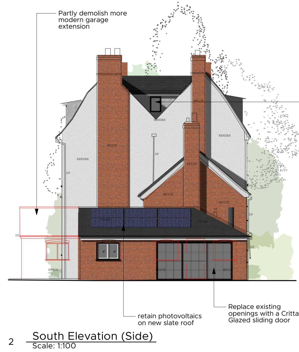
2 South Elevation (Side) Scale: 1:100