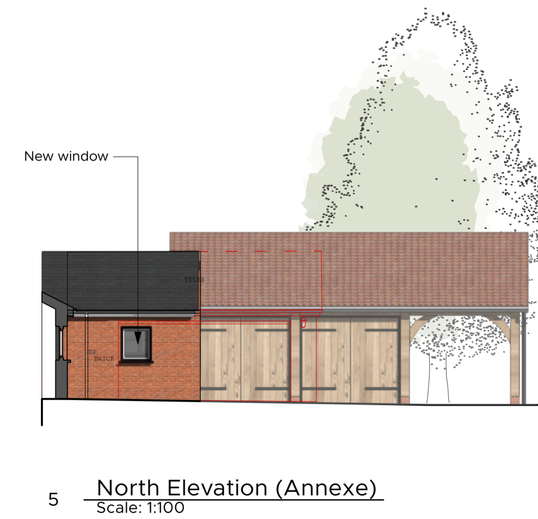
5 North Elevation (Annexe) Scale: 1:100