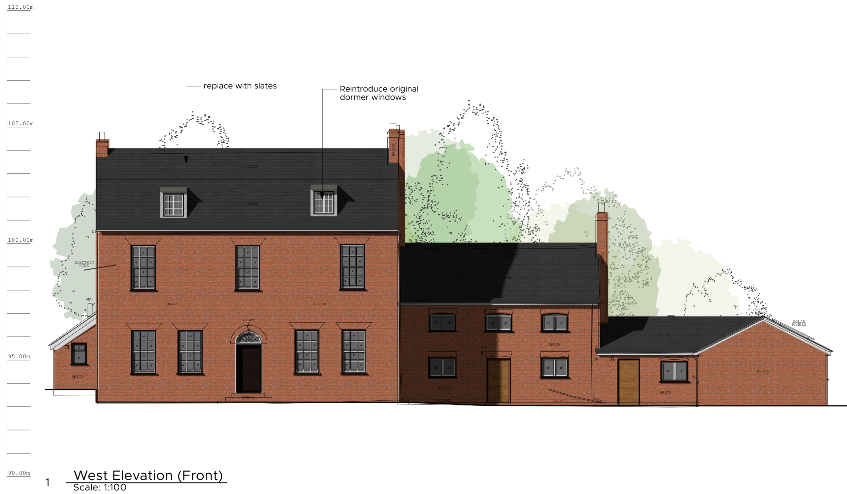
1 West Elevation (Front) Scale: 1:100