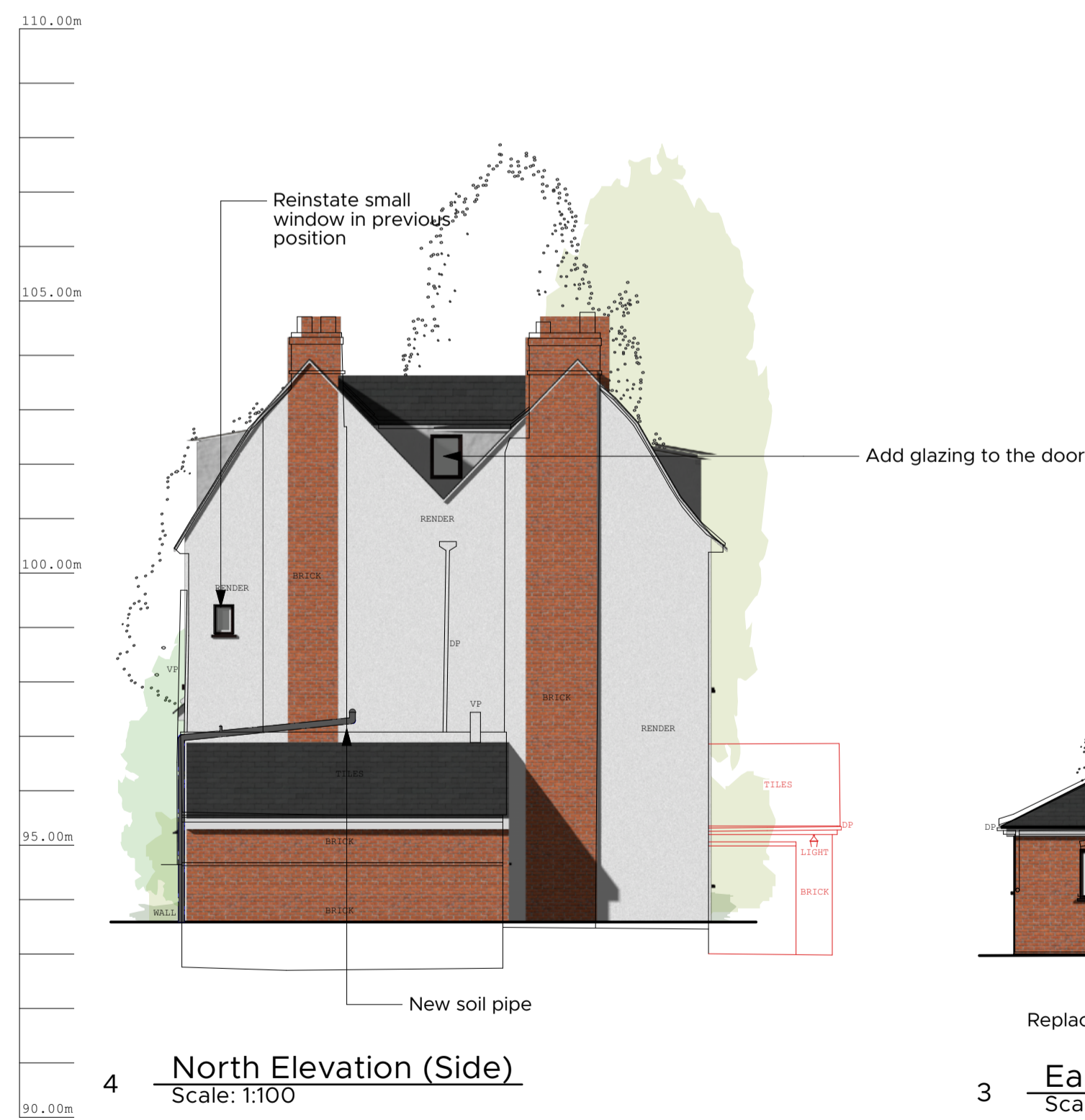
4 North Elevation (Side) Scale: 1:100