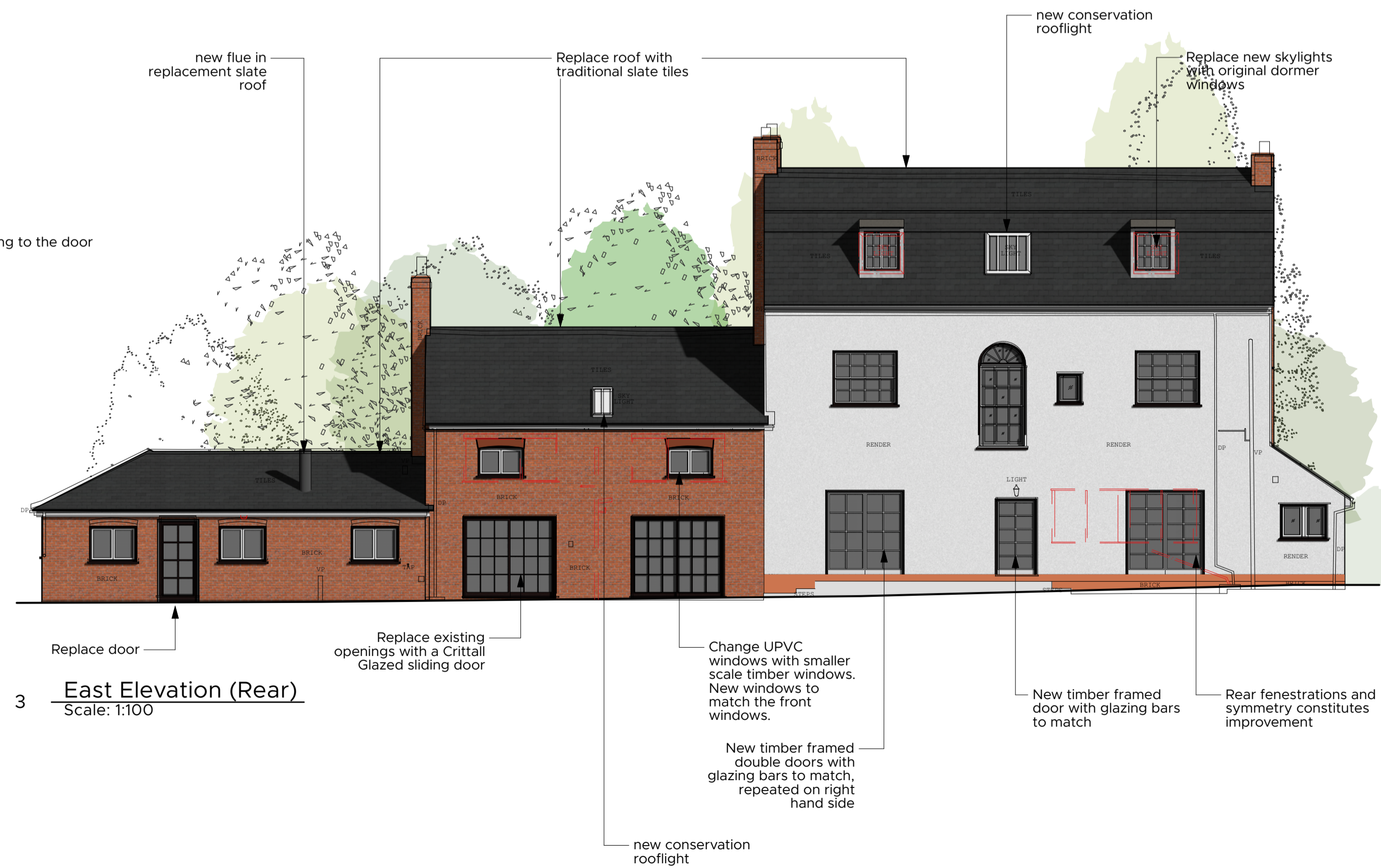
3 East Elevation (Rear) Scale: 1:100