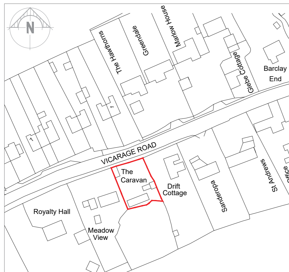
Existing Location Plan 1:1250