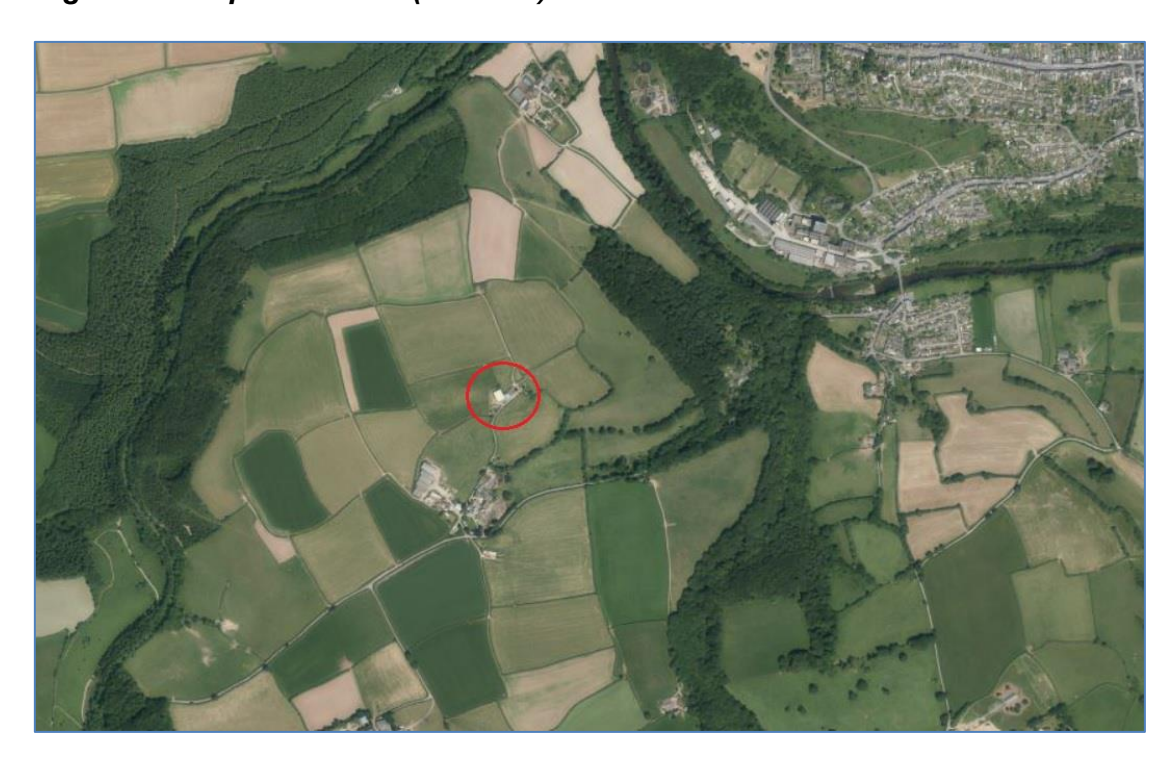
Fig 2 – Aerial photograph showing surrounding land-use.