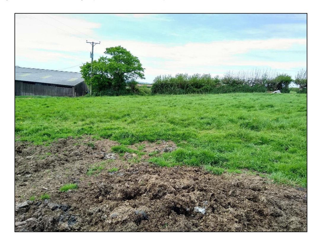
Fig 4 – Surveyed land parcel earmarked as the location of the new build.