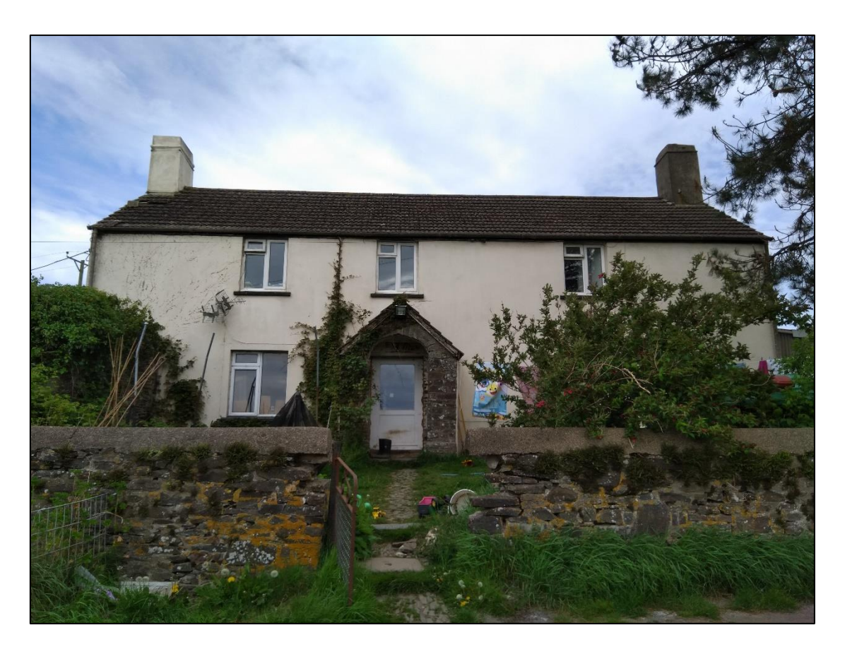
Fig 3 – Cleave Cottage (south elevations).