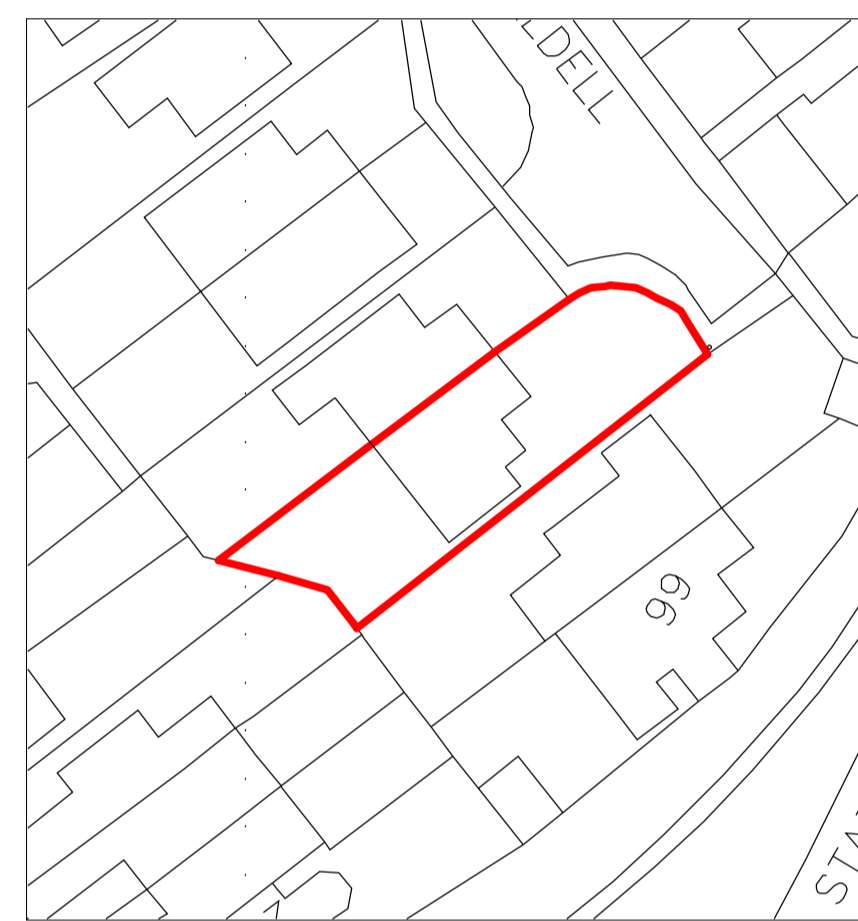
1:500 site plan