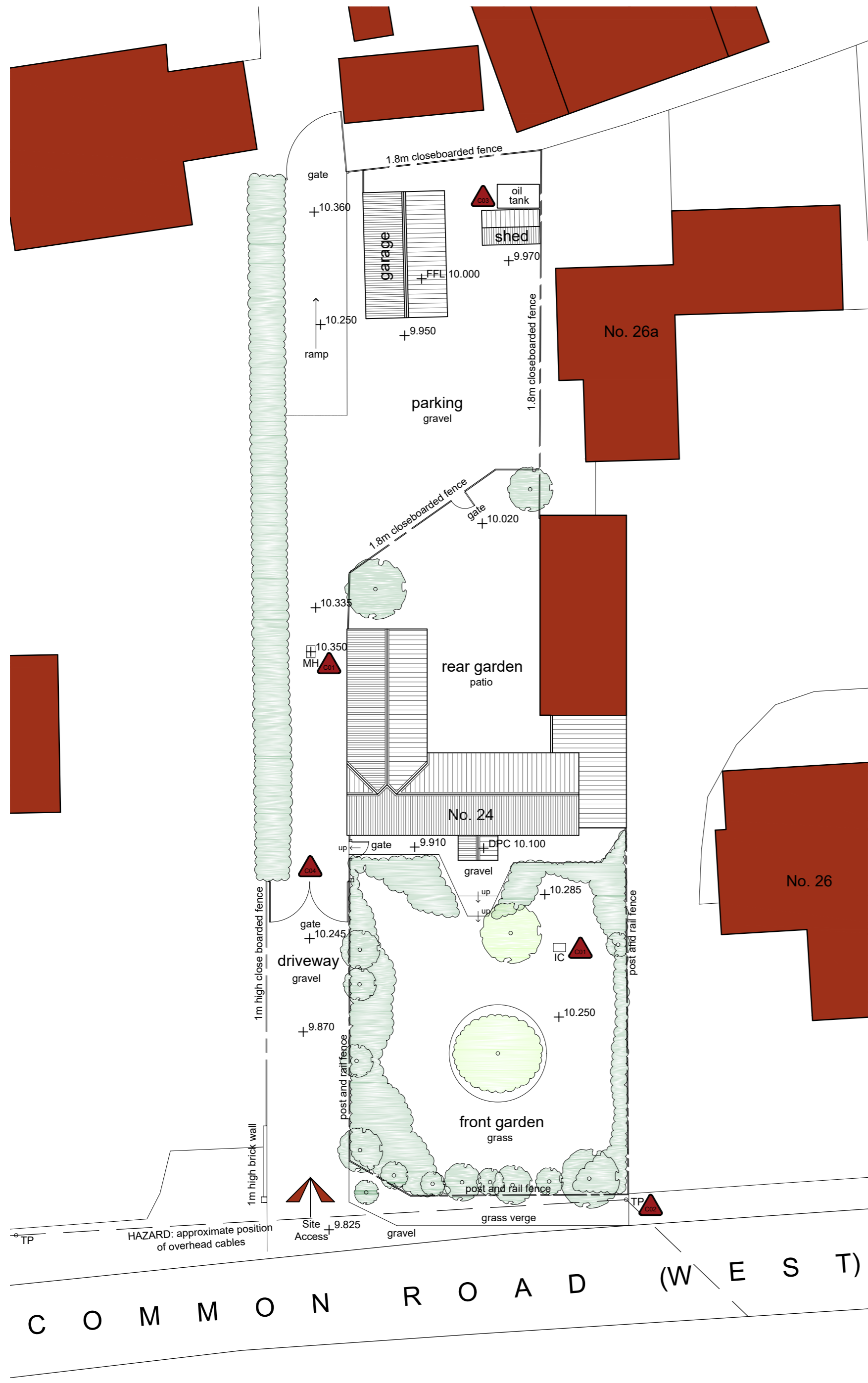
Site Plan Scale: 1:200