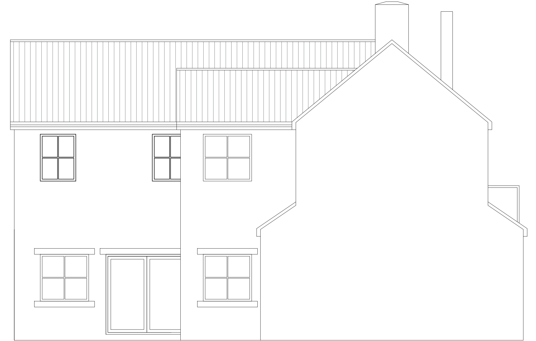
SIDE ELEVATION - ELEVATION 2