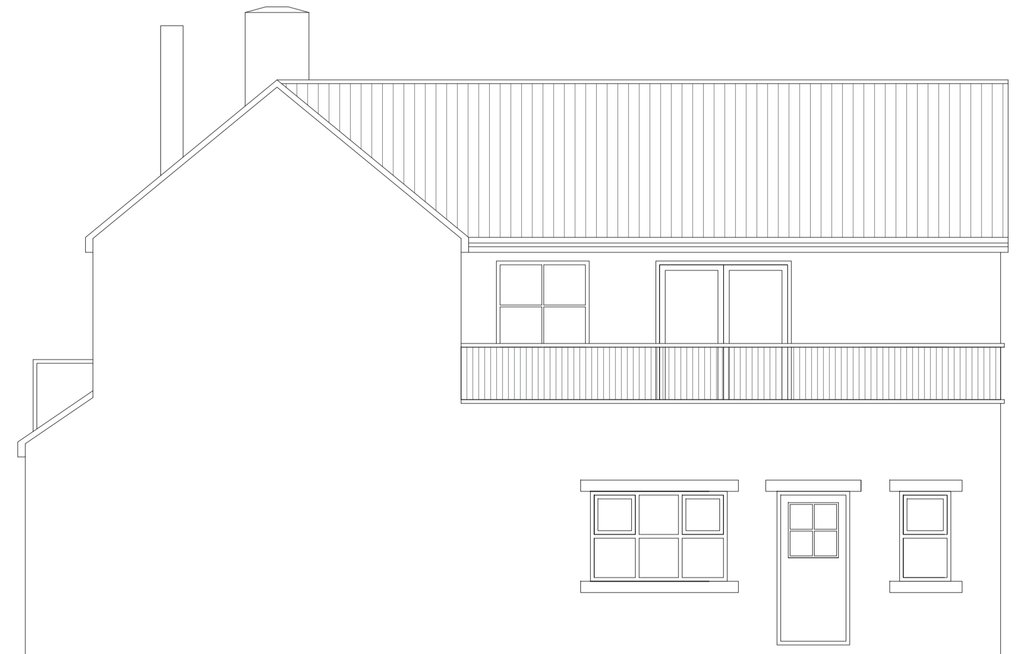
SIDE ELEVATION - ELEVATION 3