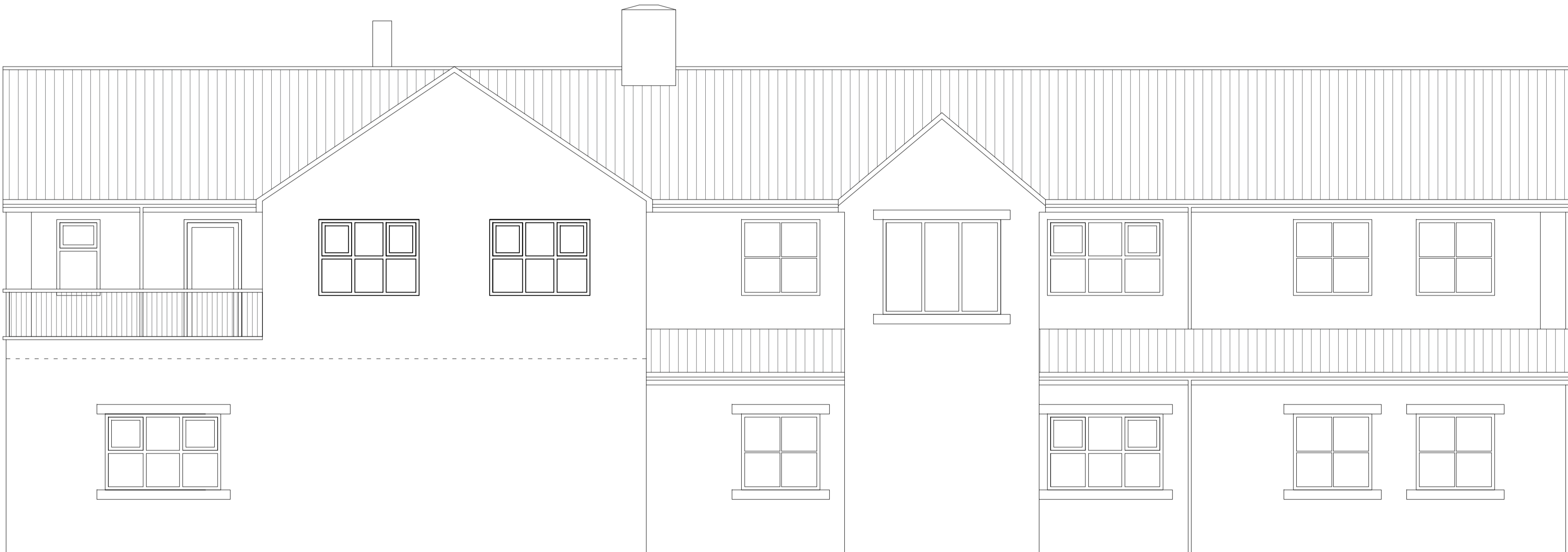
REAR ELEVATION - ELEVATION 4