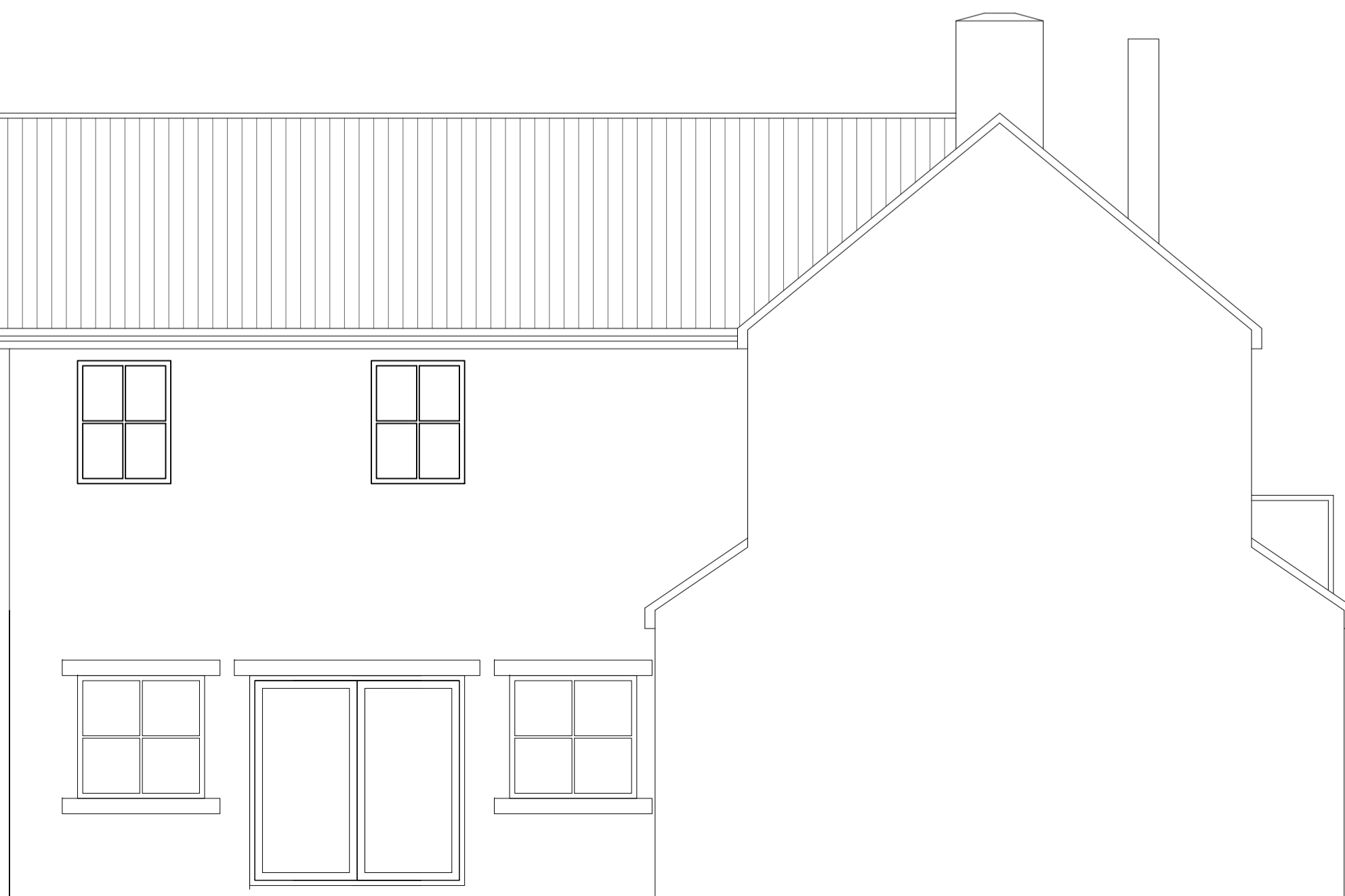
SIDE ELEVATION - ELEVATION 5