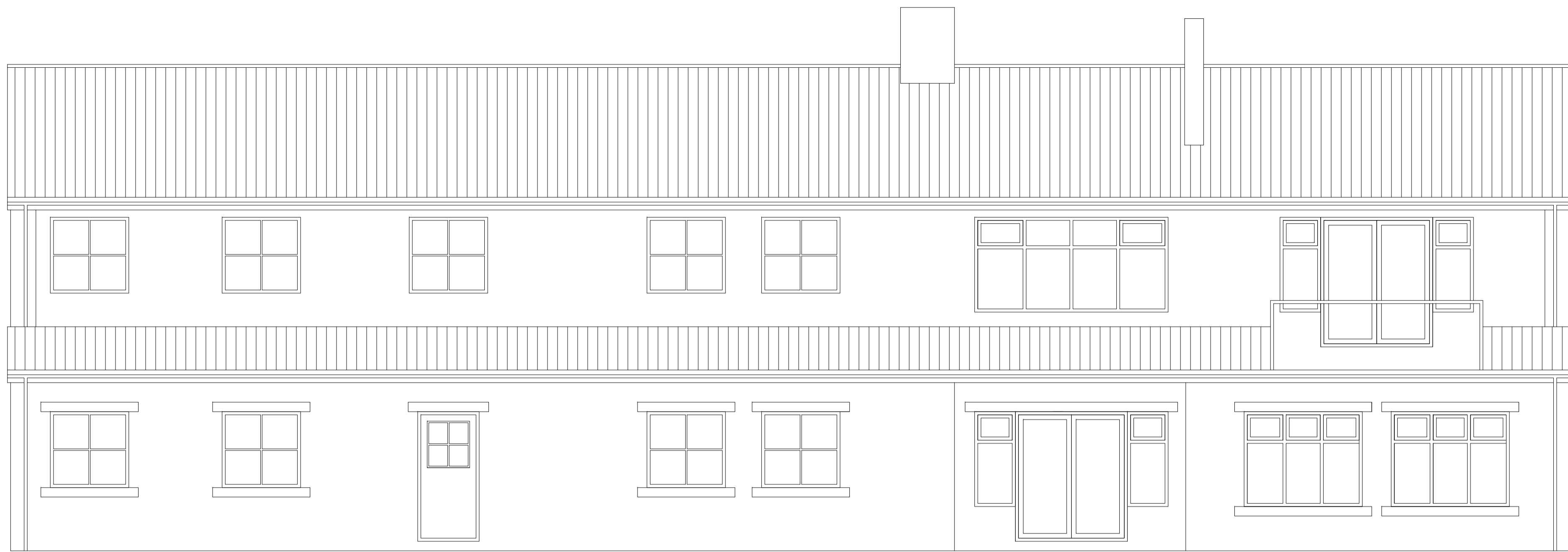
FRONT ELEVATION - ELEVATION 1