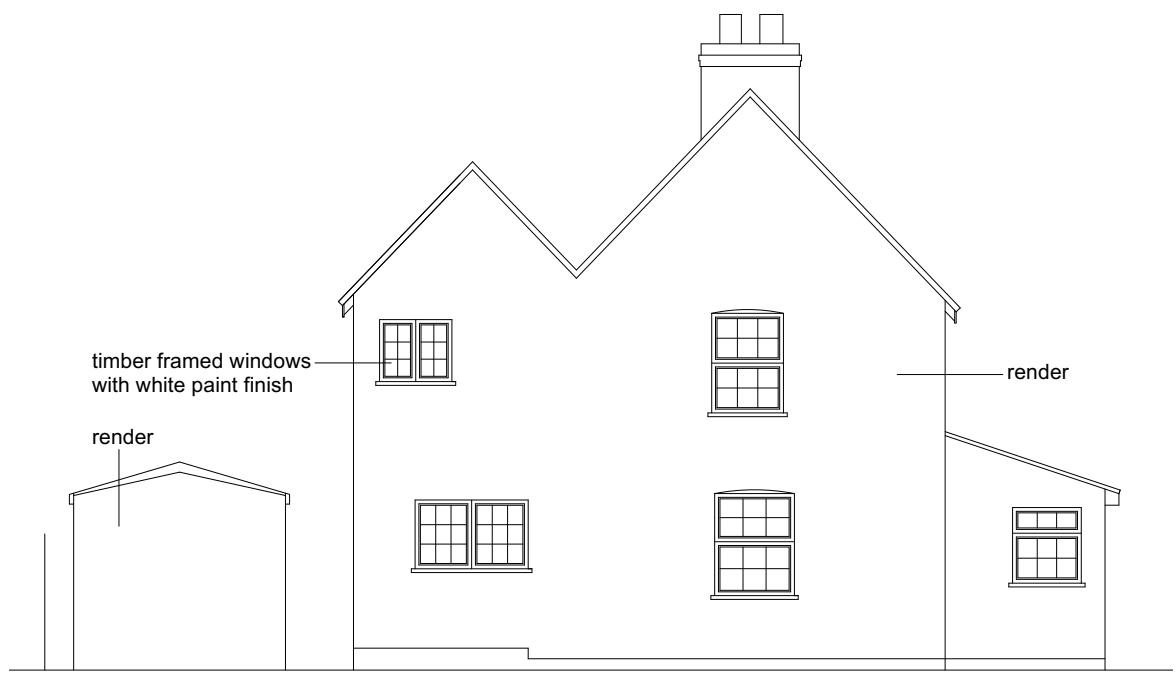
Existing rear (northwest) elevation