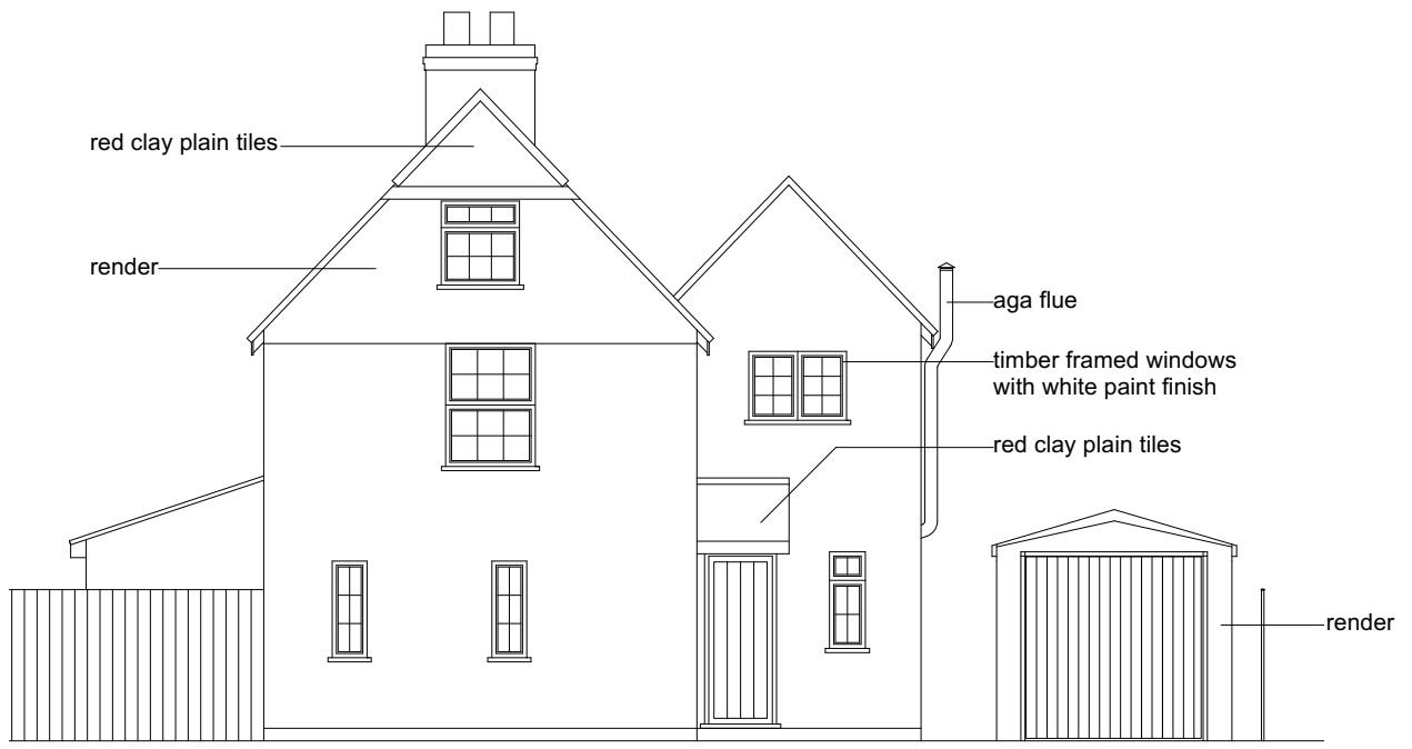
Existing front (southeast) elevation