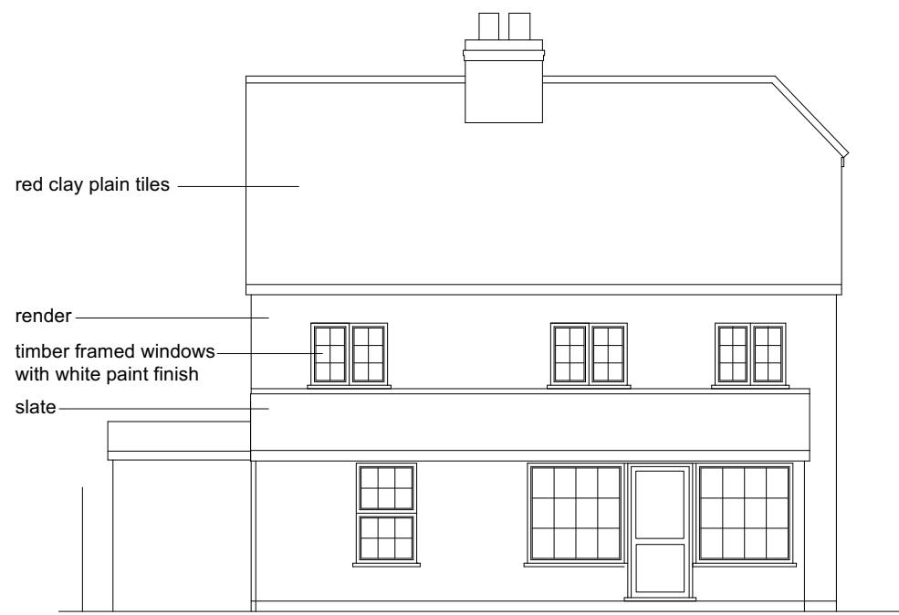
Existing side (southwest) elevation