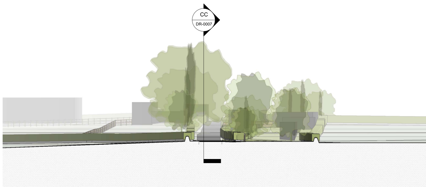
Section DD Proposed Long Section