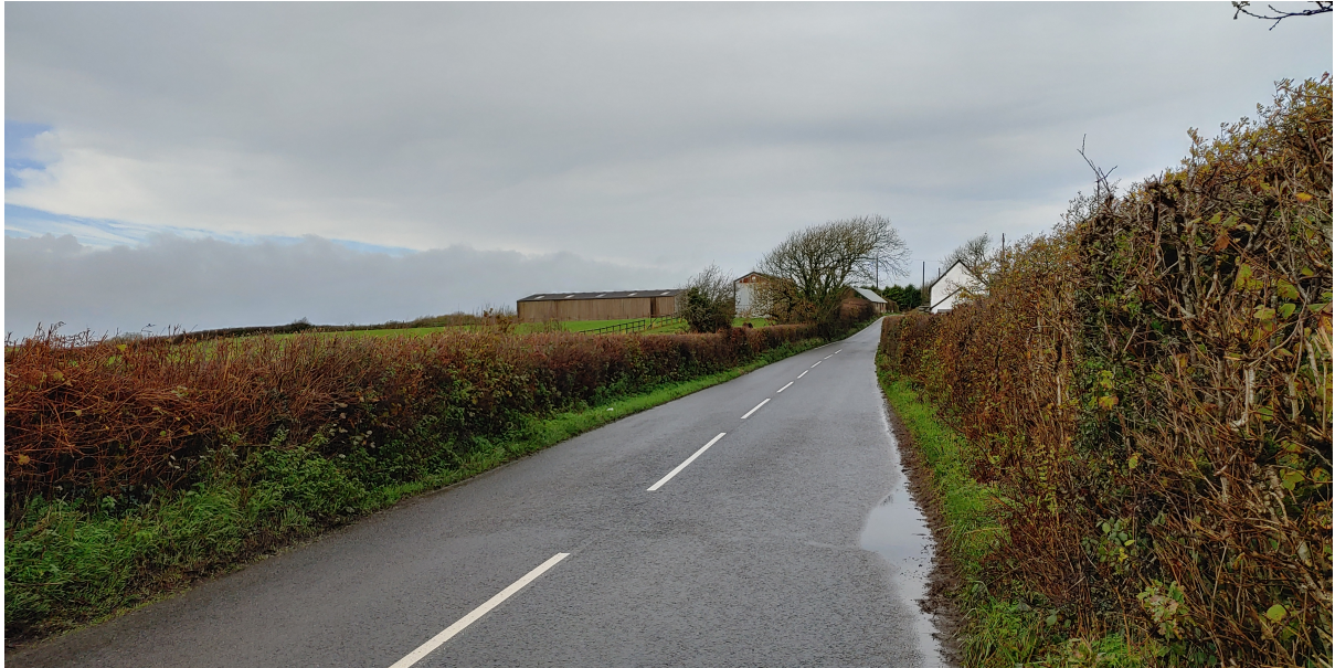
Existing visibility from the edge of highway to the North, in excess of 50m