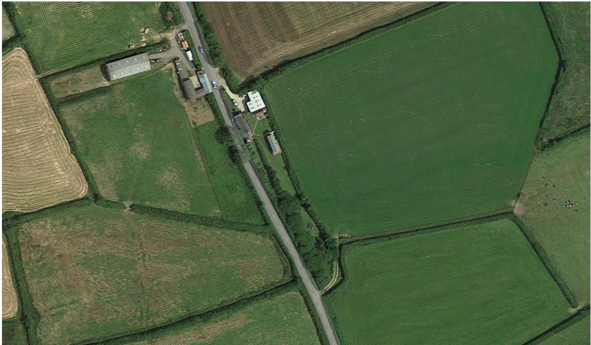
Aerial image of site