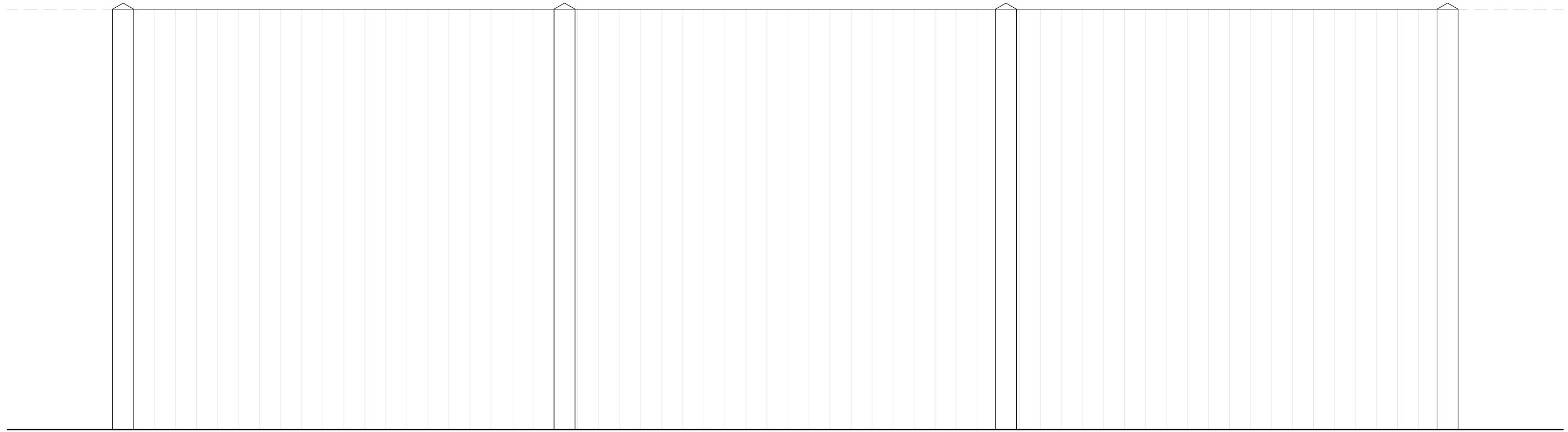
Close boarded fence h=2.0m