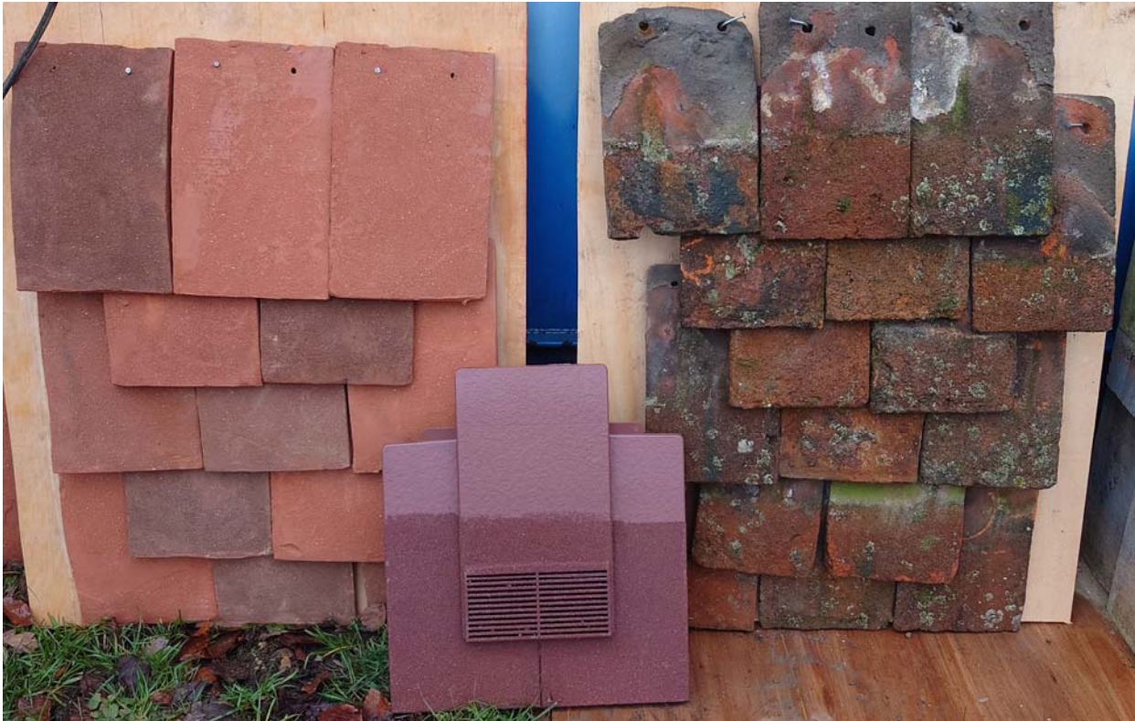
Proposed Tiles Clayhall Medium Blend Clay Roof with Existing Weathered Tiles and proposed vent Tile

Heritage Tiles Clayhall Medium Blend Clay Roof Tiles, refer to attached data sheet.