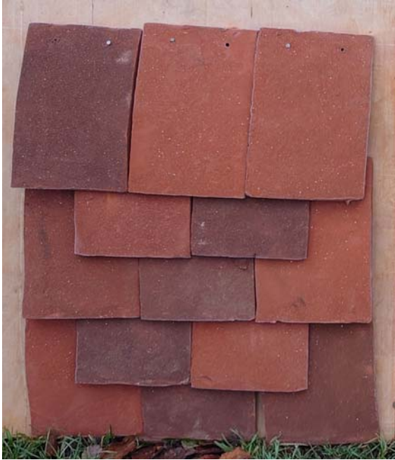
Heritage Tiles Clayhall Medium Blend Clay Roof