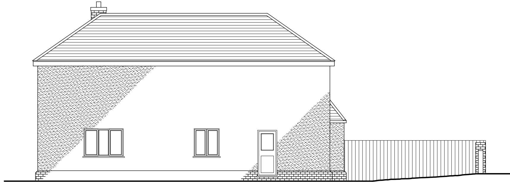
1:100 Proposed Side Elevation

This scheme is subject to Town Planning and all other necessary consents. Dimensions, areas and levels where given are only approximate and subject to site survey. All dimensions are to be checked on site, do not scale. This drawing is to be read in conjunction with all relevant consultants' and/or specialists' drawings / documents and any discrepancies or variations are to be notified to the designer before the affected work commences. All queries relating to design of foundations, floor slabs and any structural elements are to be referred to the structural engineering consultant for resolution. All feasibility studies are subject to full site survey. The workmanship of all relevant trades and building operations shall comply with the recommendations of British Standard (BS) 8000:1989 parts 1-15 inclusive. All design and construction is to be in accordance with the Construction, Design and Management Regulations 2007. All Existing buildings remain unsurveyed