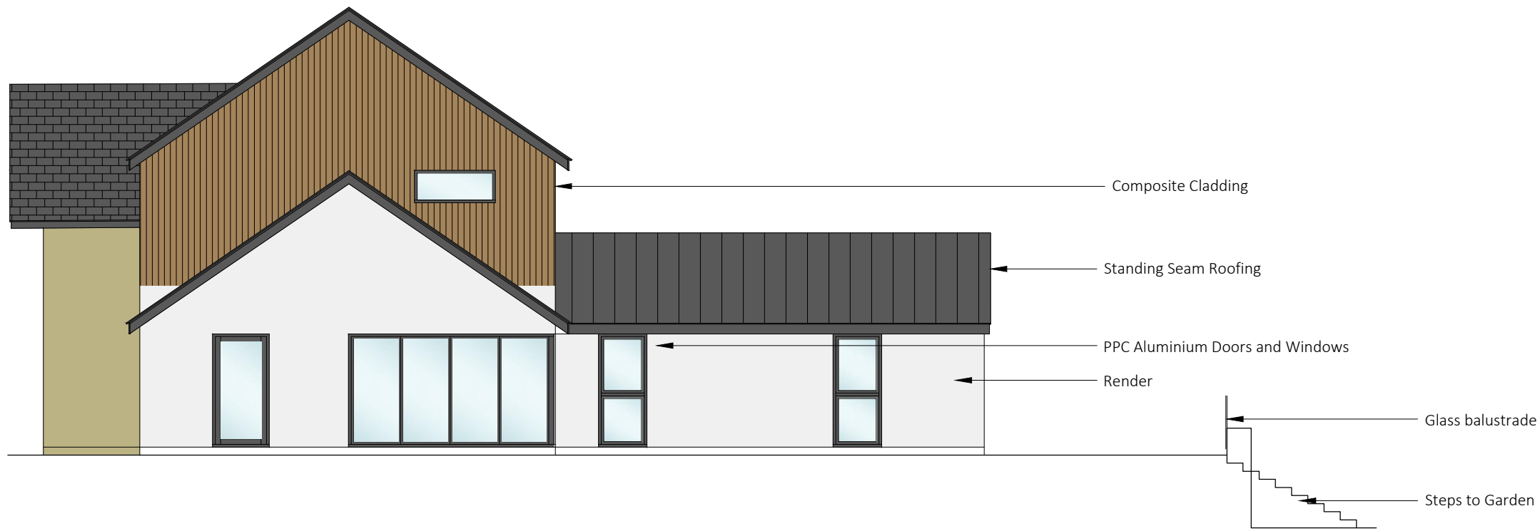
Eastern Elevation as Proposed Scale: 1:100

Proposed replacement dwelling The Shingles, Chelvey Batch, Backwell North Somerset, BS48 3BZ