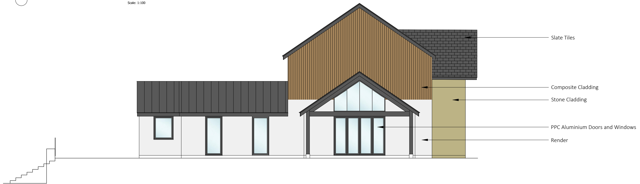
Western Elevation as Proposed Scale: 1:100