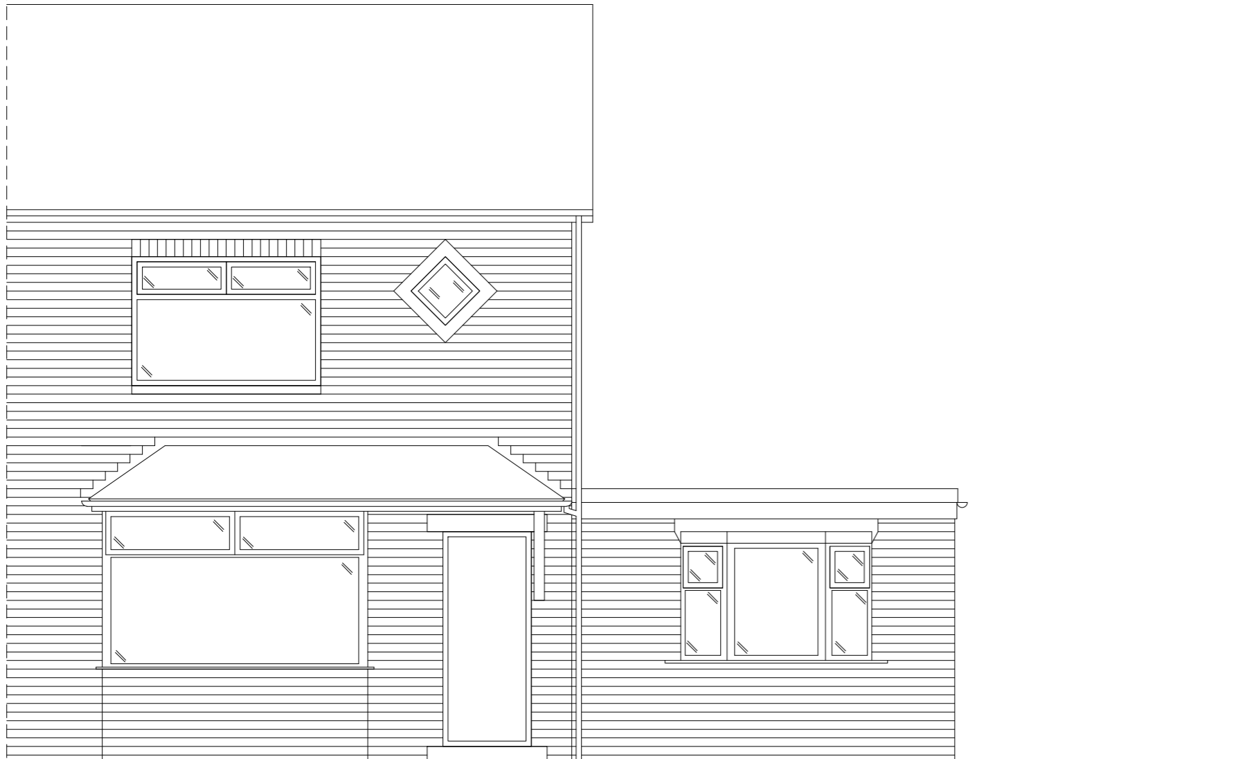
EAST (FRONT) ELEVATION