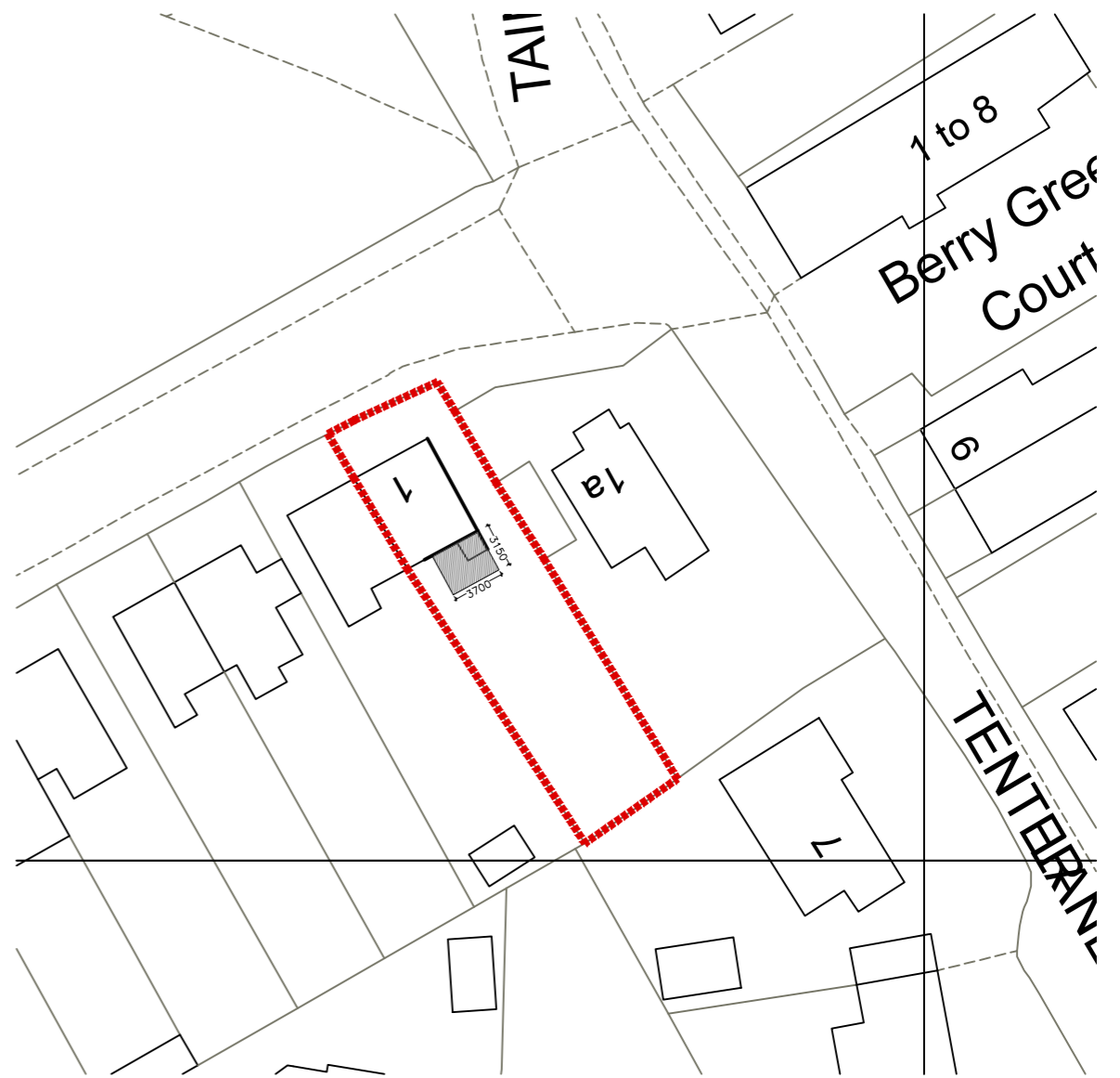
02 Block Plan 1:500 @ A3