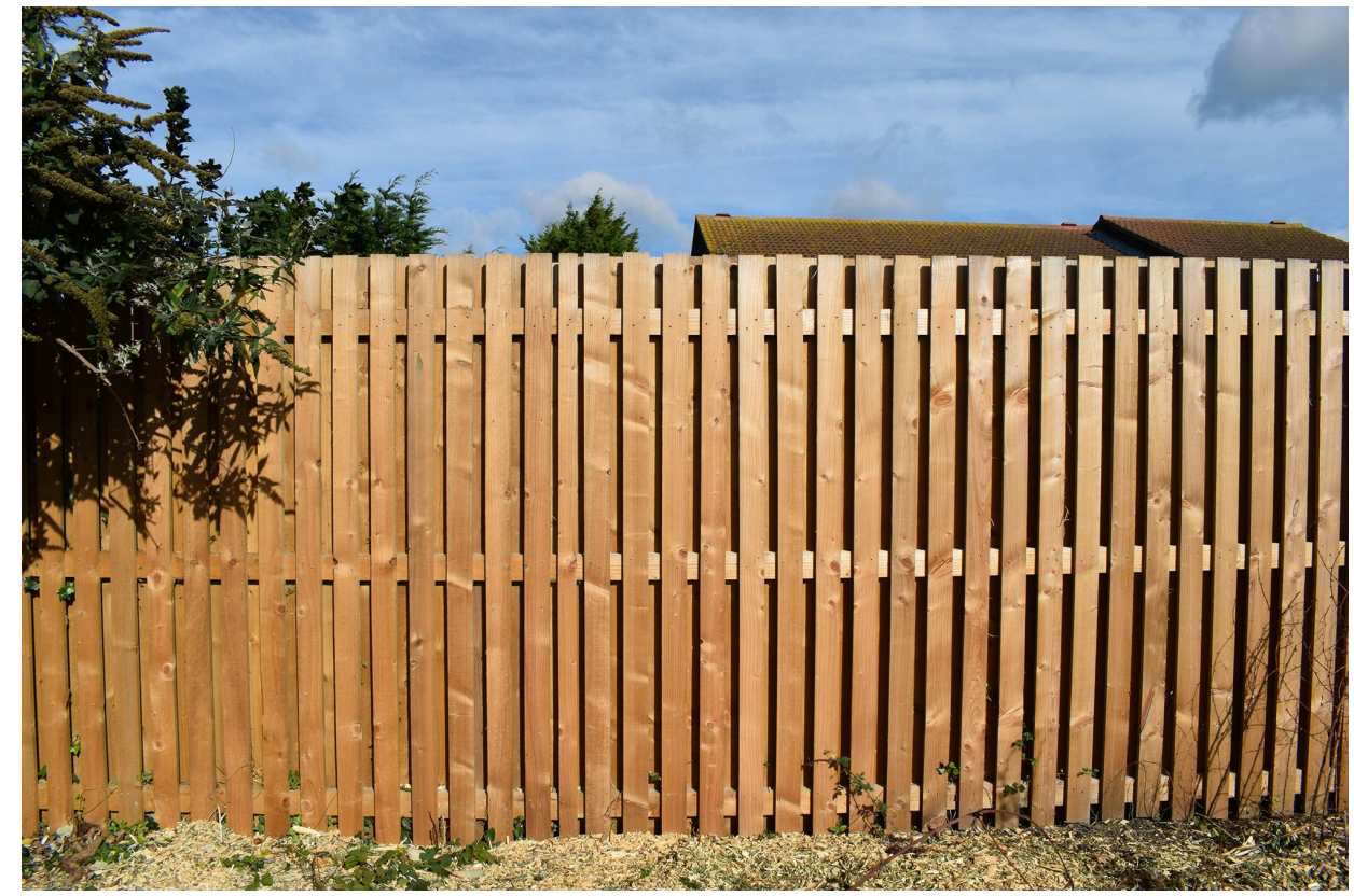
TYPICAL HIT & MISS TIMBER FENCE