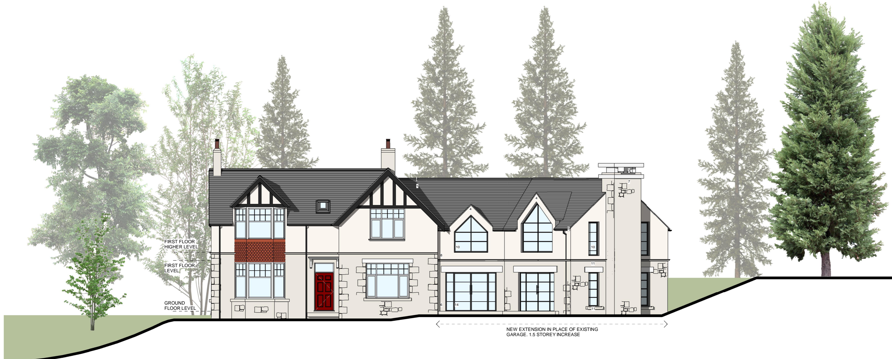
WEST (FRONT) ELEVATION