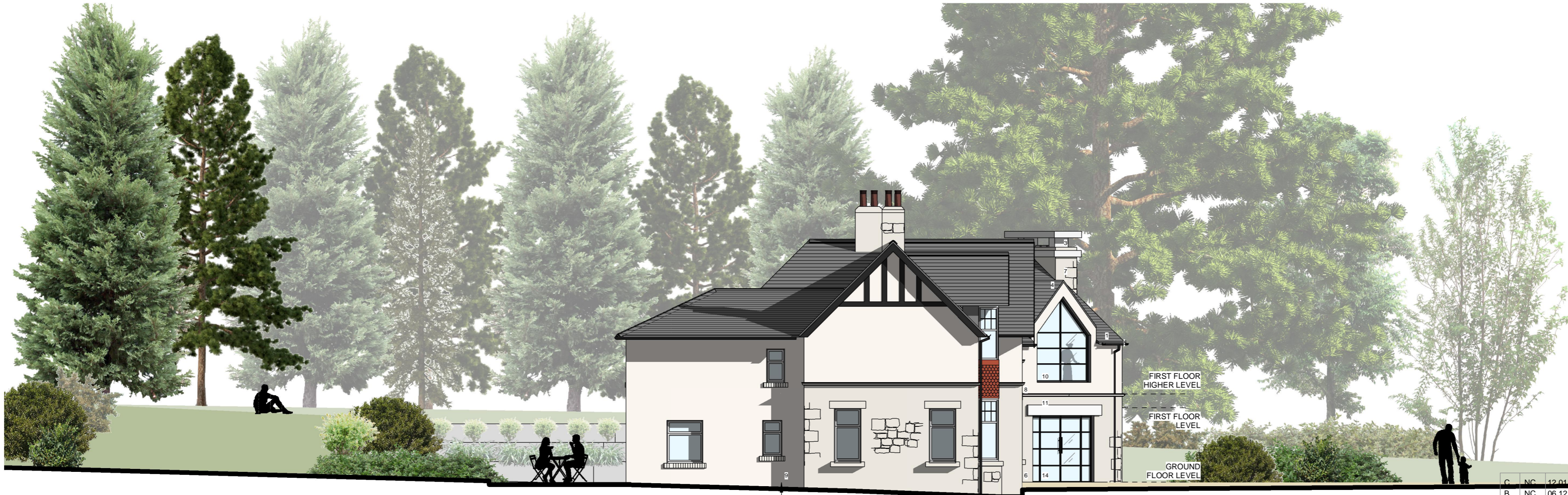
NORTH (SIDE) ELEVATION

EXISTING BRICKWORK RENDERED TO MATCH EXISTING MAIN BUILDING