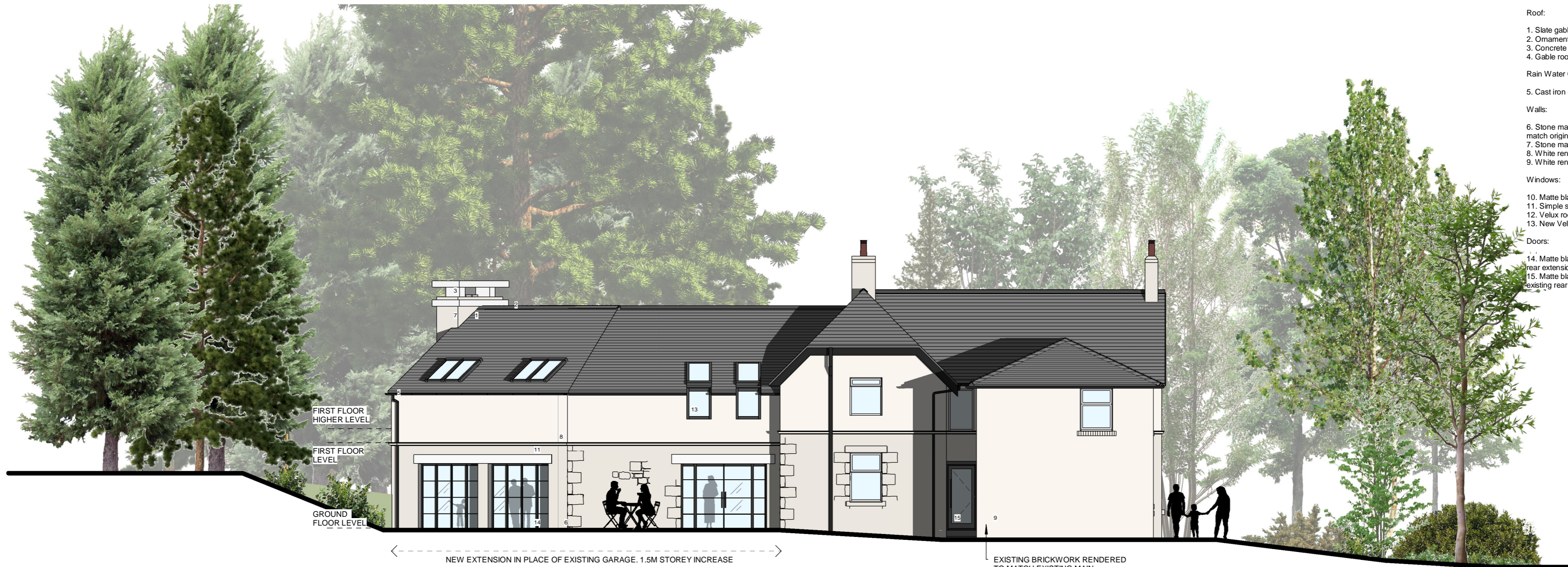
EAST (REAR) ELEVATION