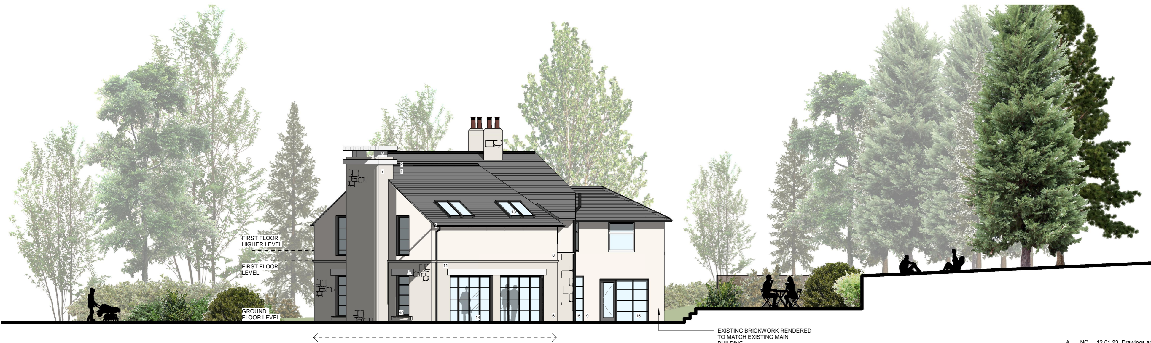
SOUTH (SIDE) ELEVATION