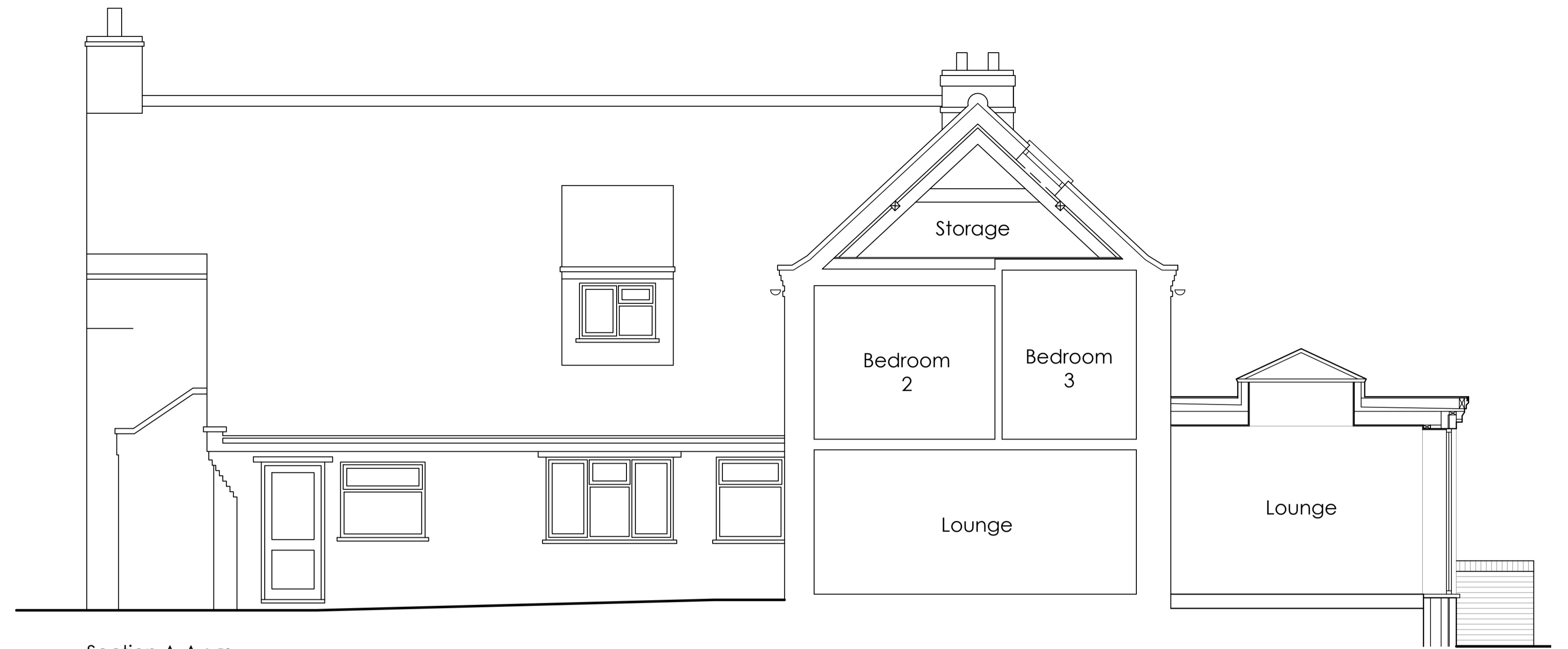
Section A-A 1:50