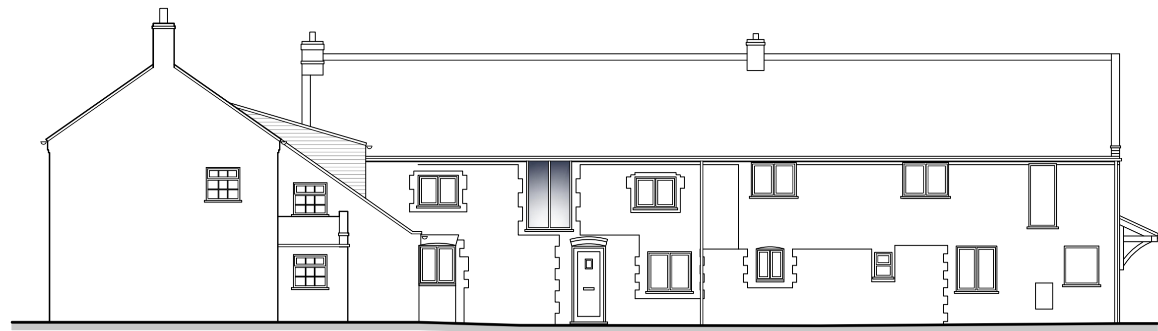
North Elevation 1:100