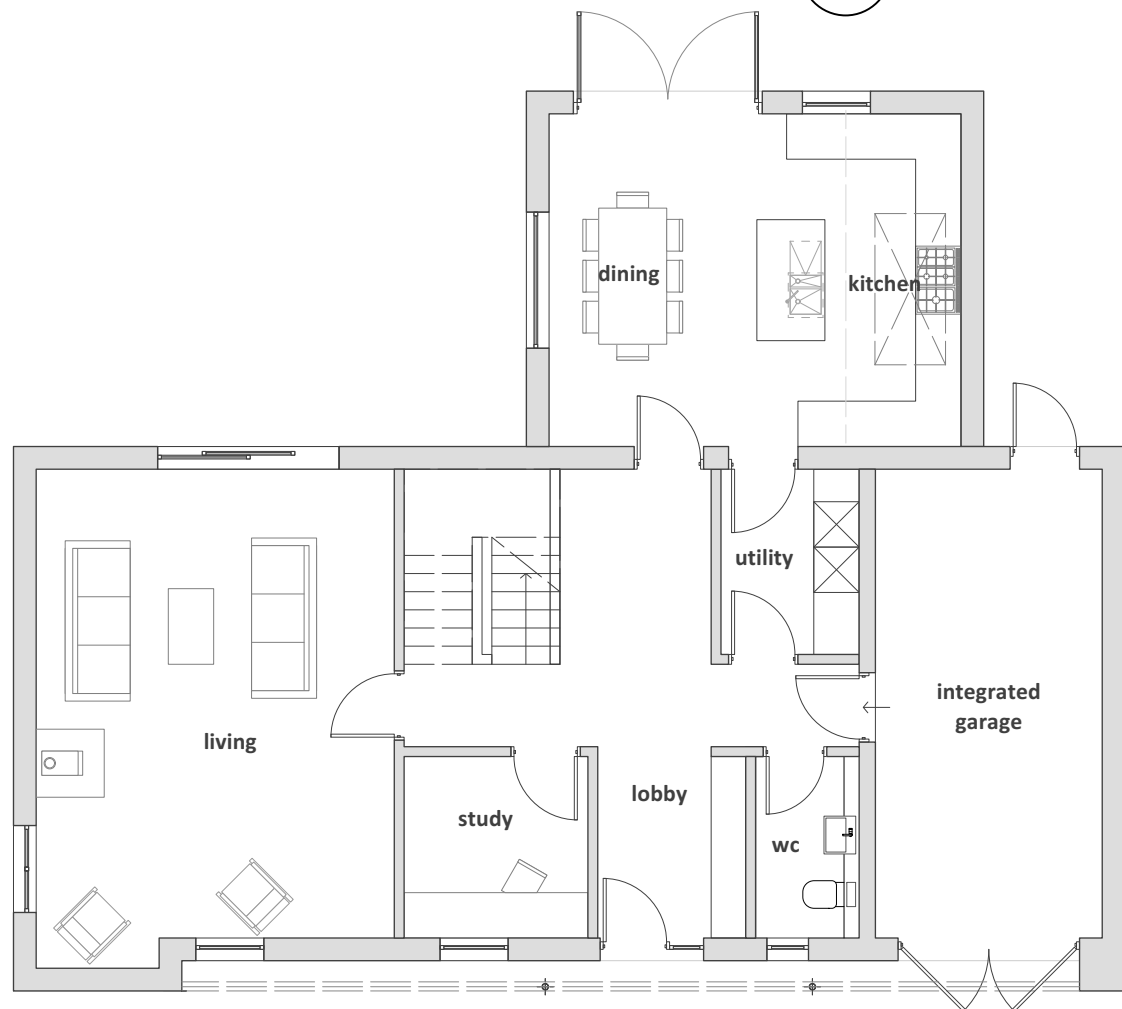
1 Unit 2 - Ground Floor Scale: 1:100