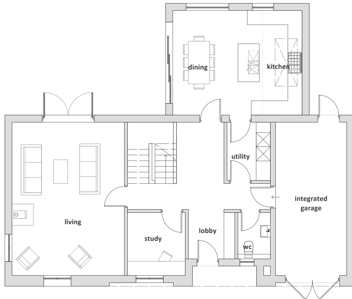
1 Unit 3 - Ground Floor Scale: 1:100