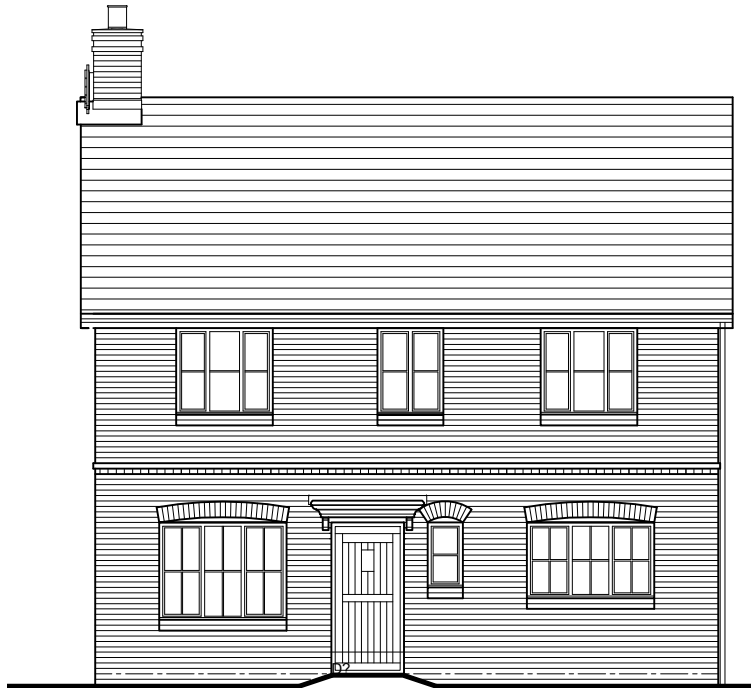
Side Elevation (Brick) Scale 1:100