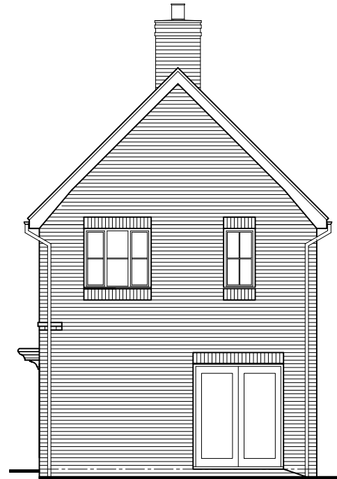
Rear Elevation (Brick) Scale 1:100