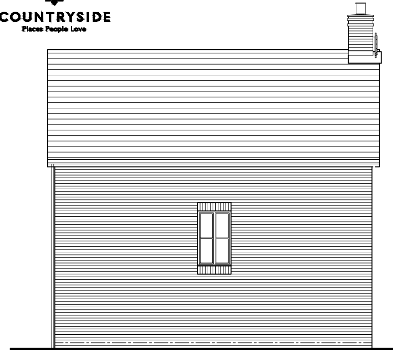
Side Elevation (Brick) Scale 1:100