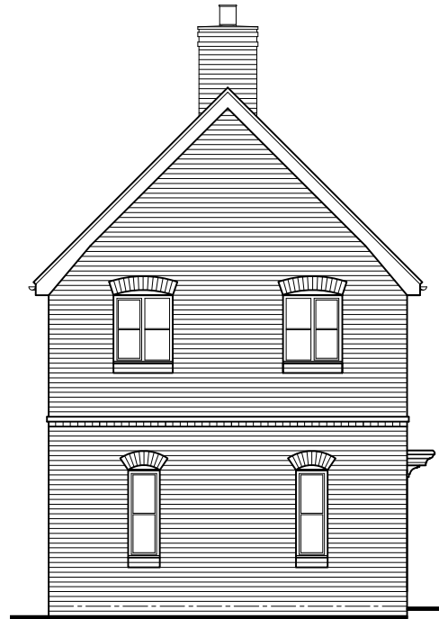
Front Elevation (Brick) Scale 1:100