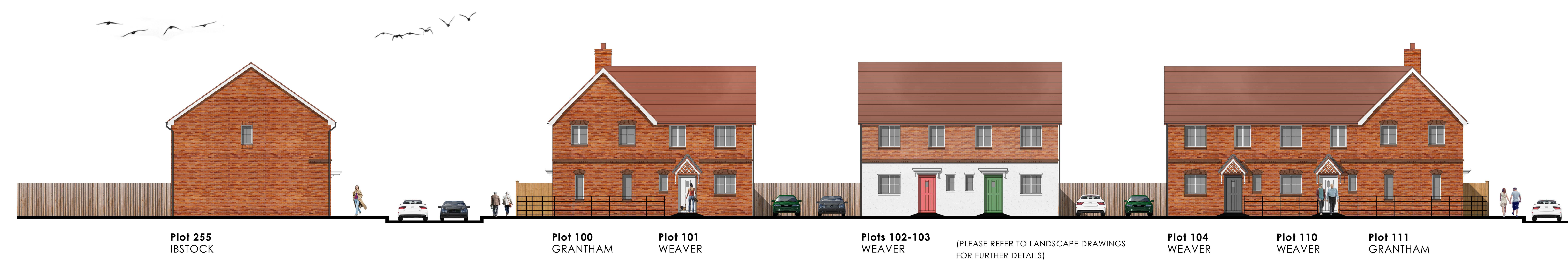
STREET SCENE 2