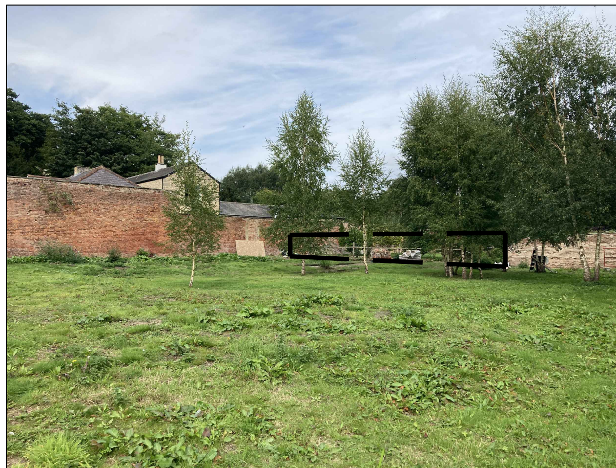
Proposed location of boundary wall (behind trees)