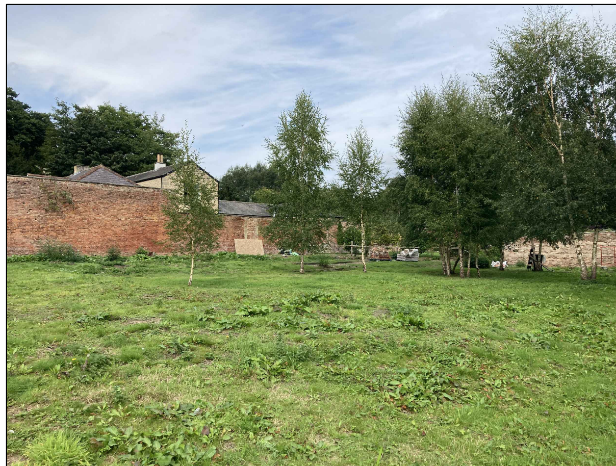
Existing fence location (behind trees)