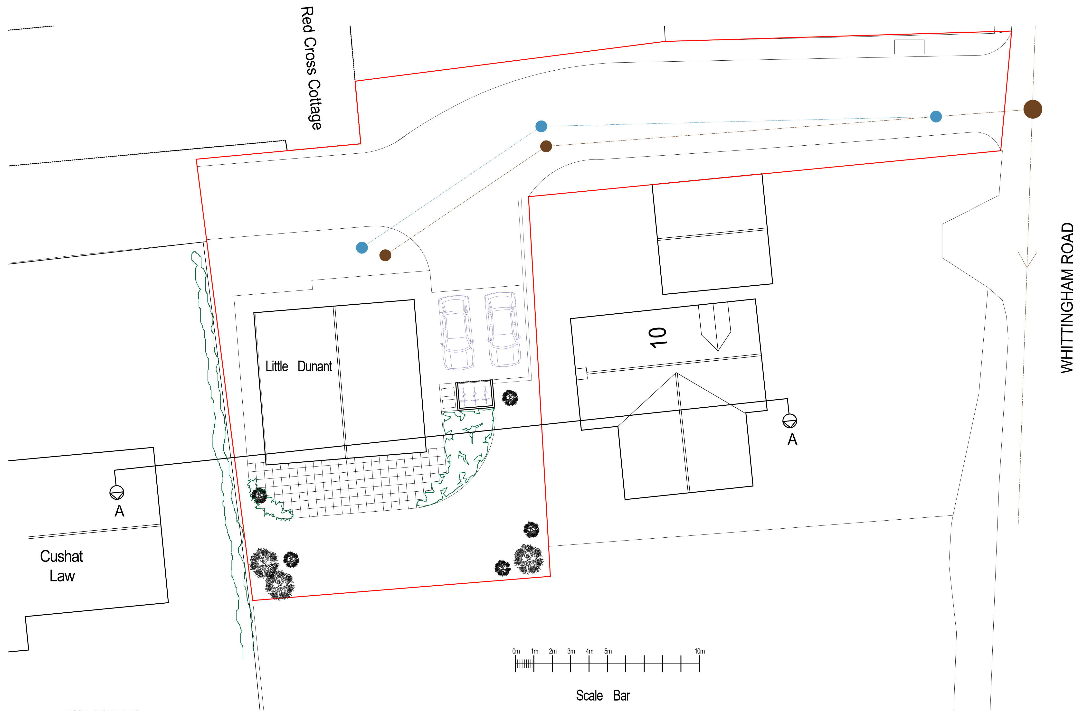
ROOF & SITE PLAN