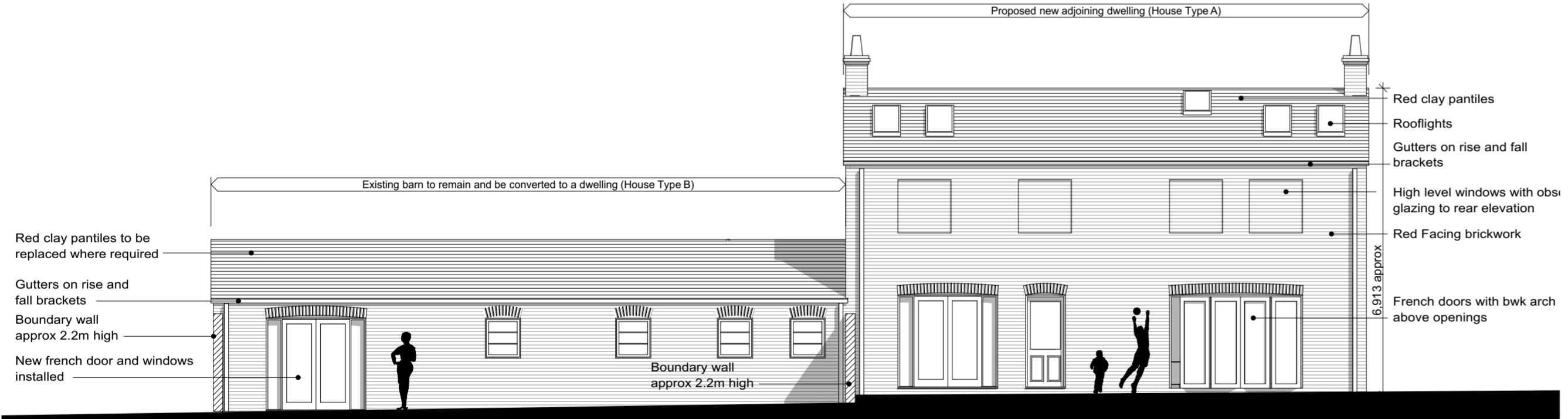
Proposed Side Elevation - Retained Barn House Type B and Adjoining House Type A