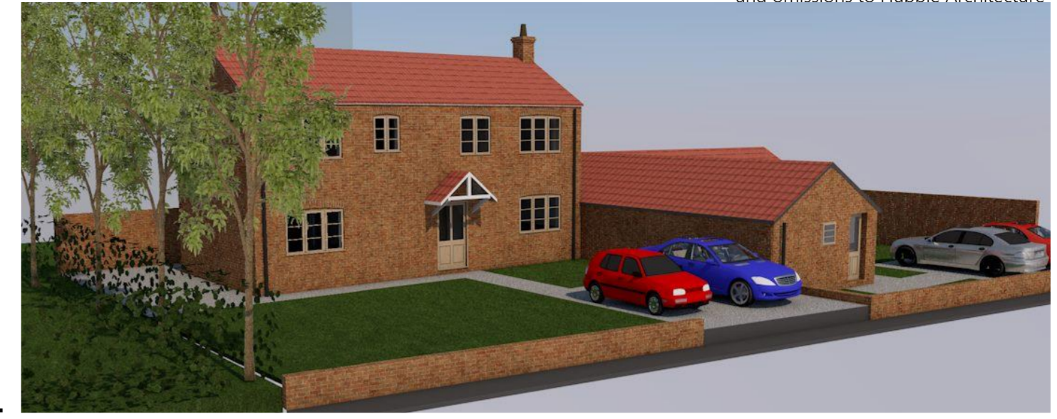
Proposed Front Elevation - House Type A and Retained Barn House Type B

Check all dimensions on site. Do not scale from this drawing. Report any discrepancies and omissions to Hubble Architecture.