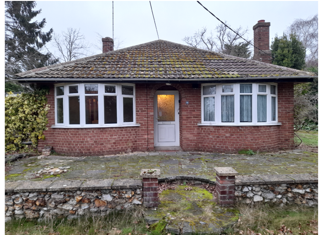
front as existing