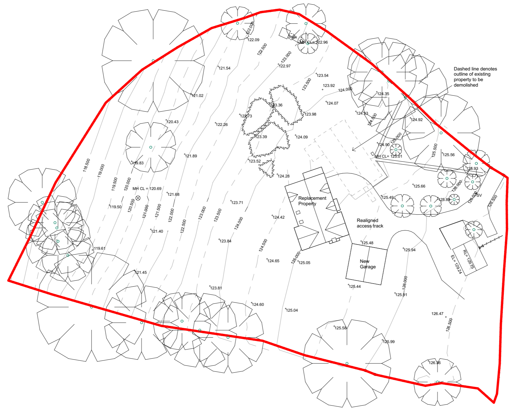
Proposed Site Plan 1:500 @ A3

03.02.23 Rev A Red and blue line boundary revised following LPA comments. AT