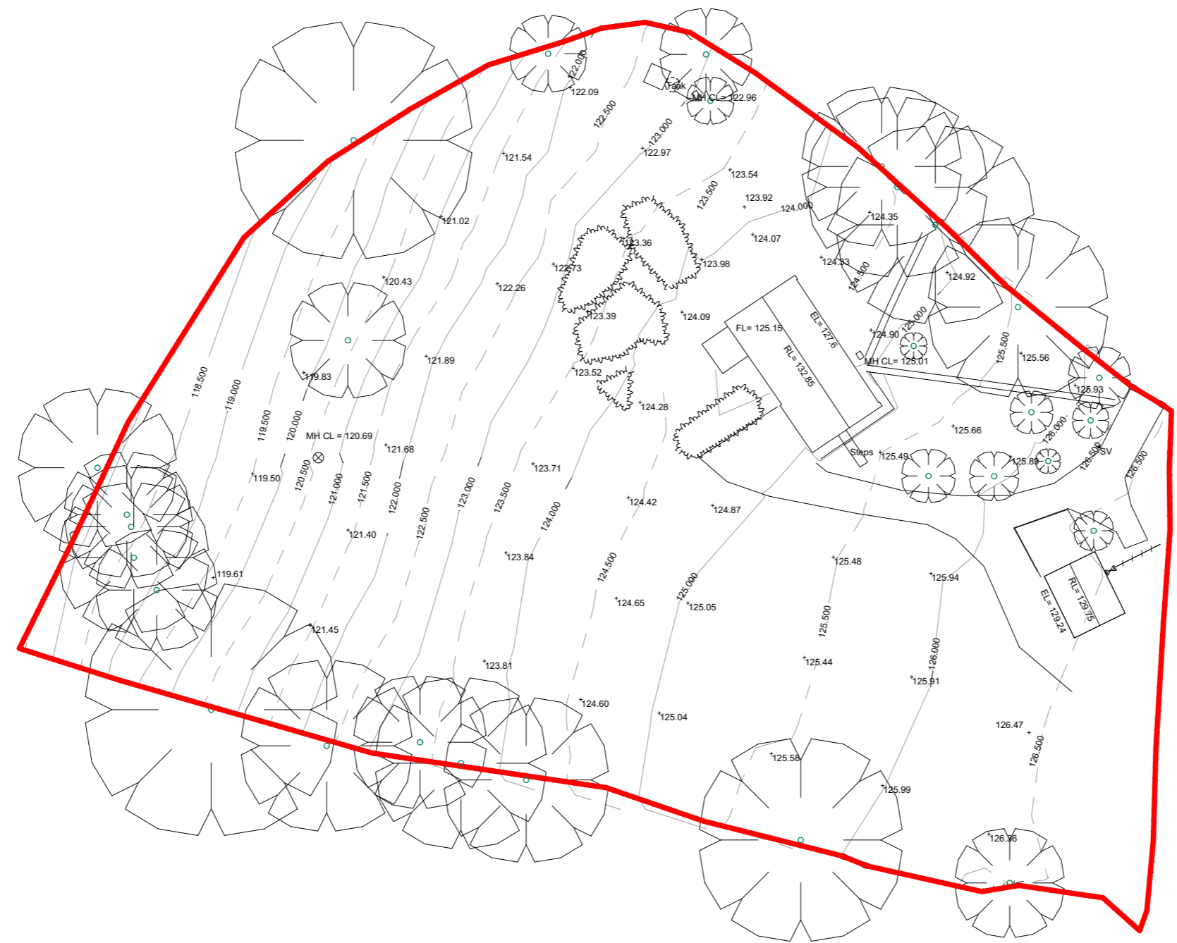
Existing Site Plan 1:500 @ A3

03.02.23 Rev A Red and blue line boundary revised following LPA comments. AT