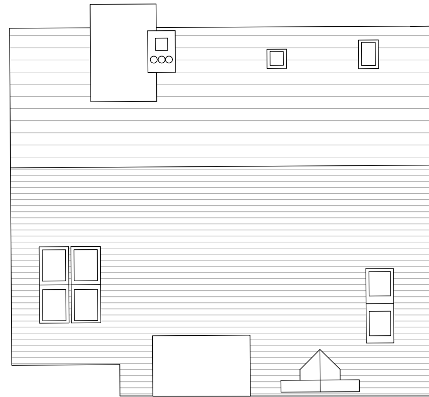
Existing Roof Plan