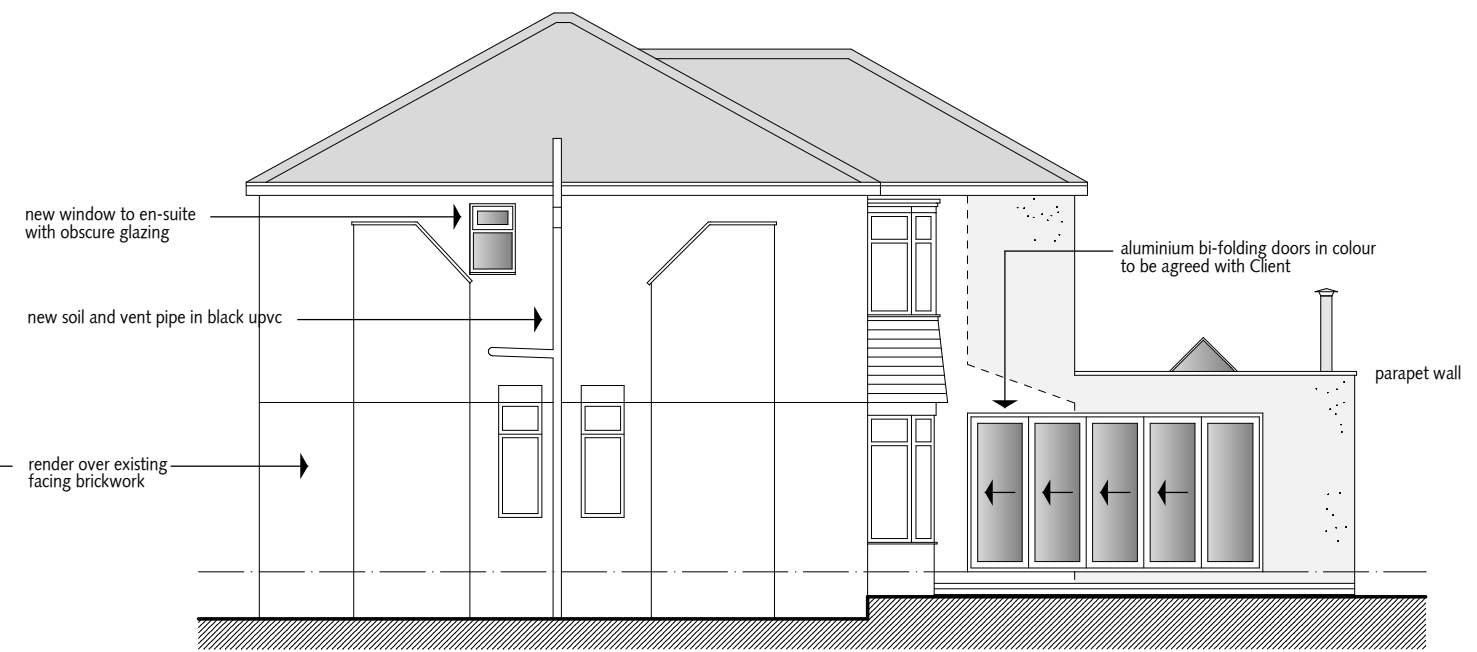
side elevation as proposed