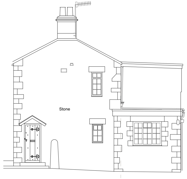
EAST ELEVATION C-C