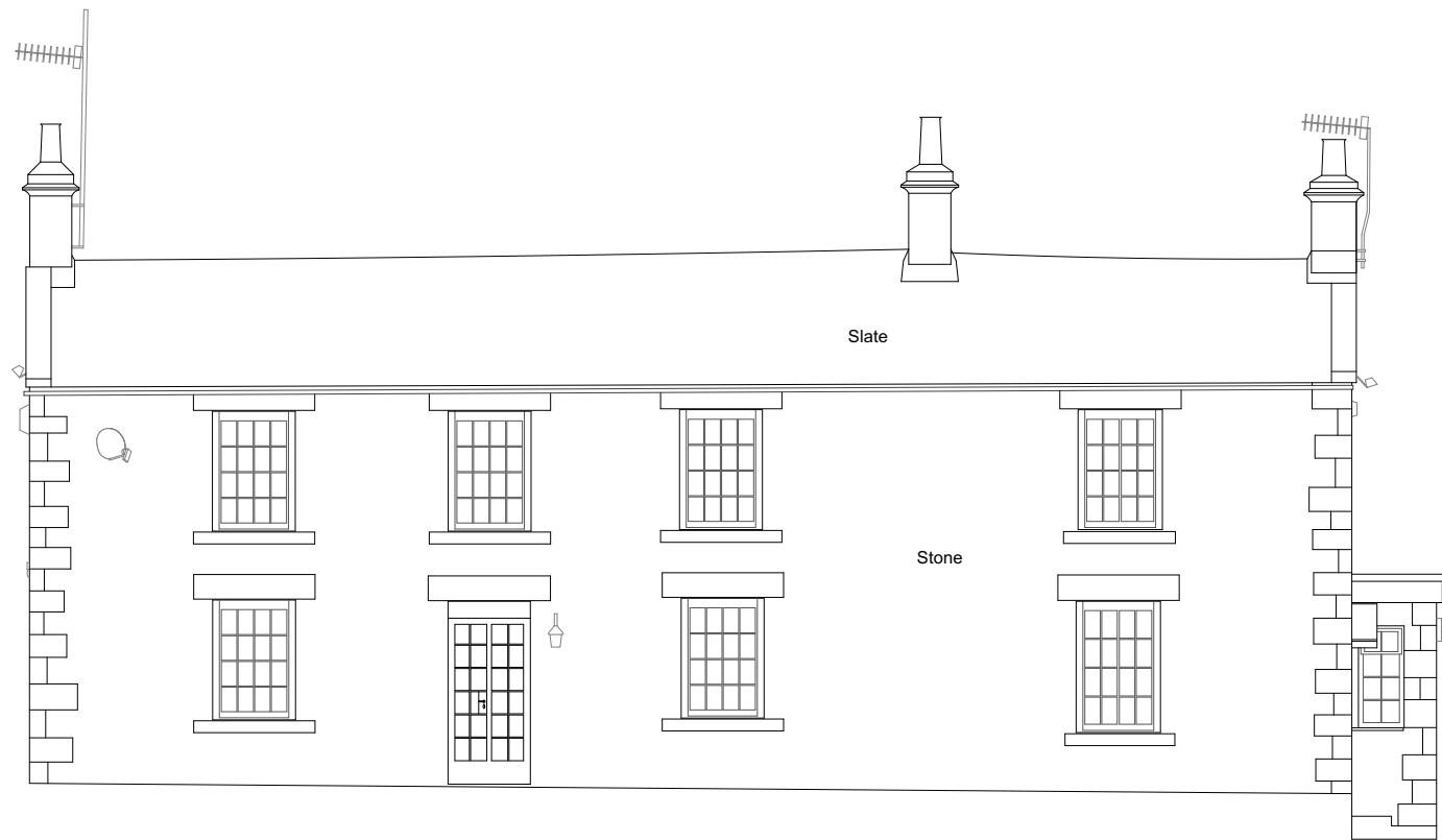
SOUTH ELEVATION D-D