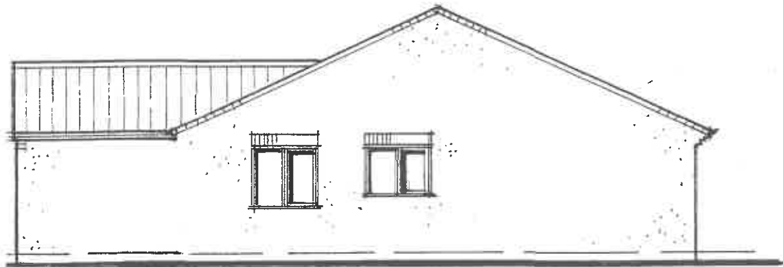
SIDE ELEVATION (WEST)