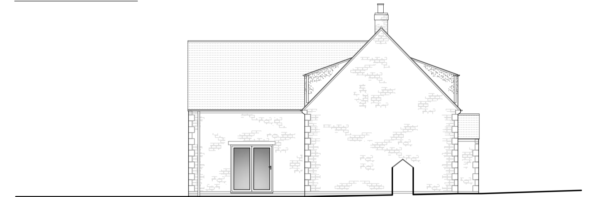
Side (south west)