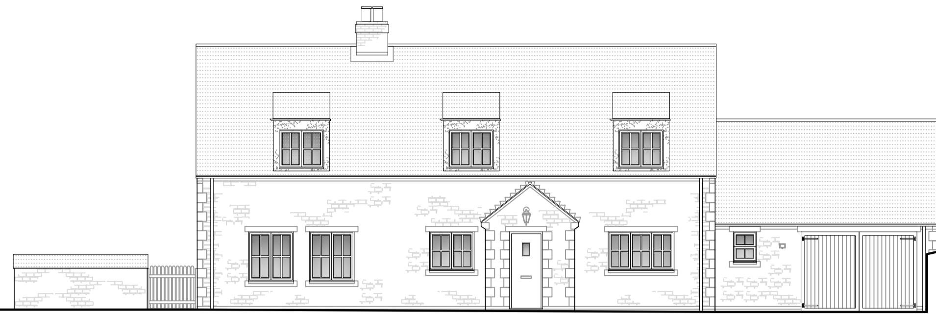
Front (south east)