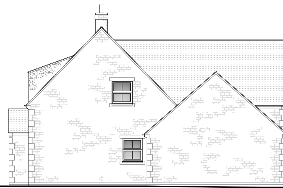
Side (north east)