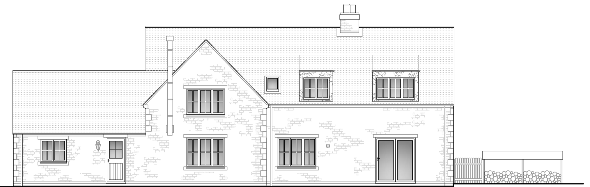
Rear (north west)