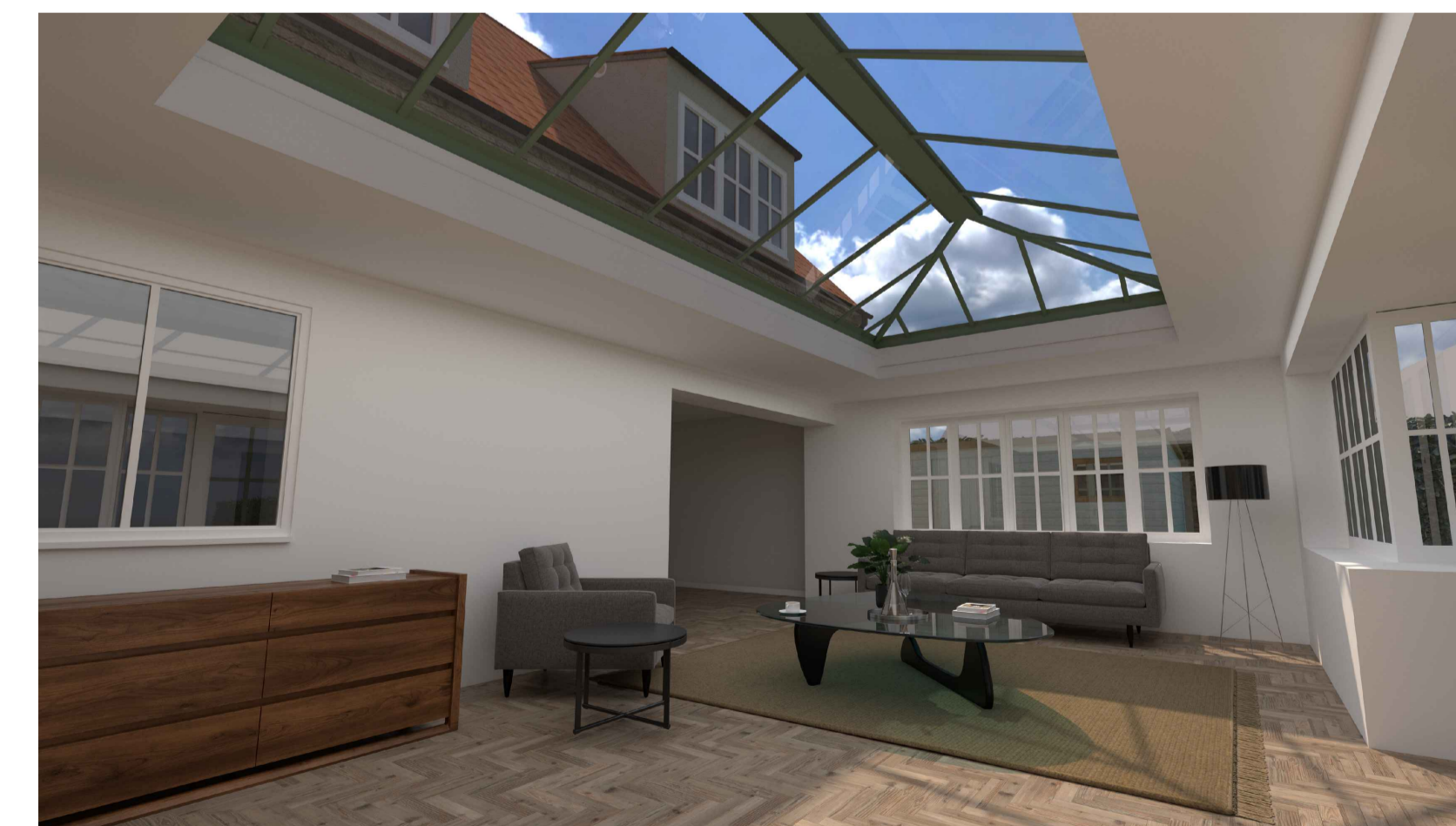
Proposed Internal Visual (n.t.s)