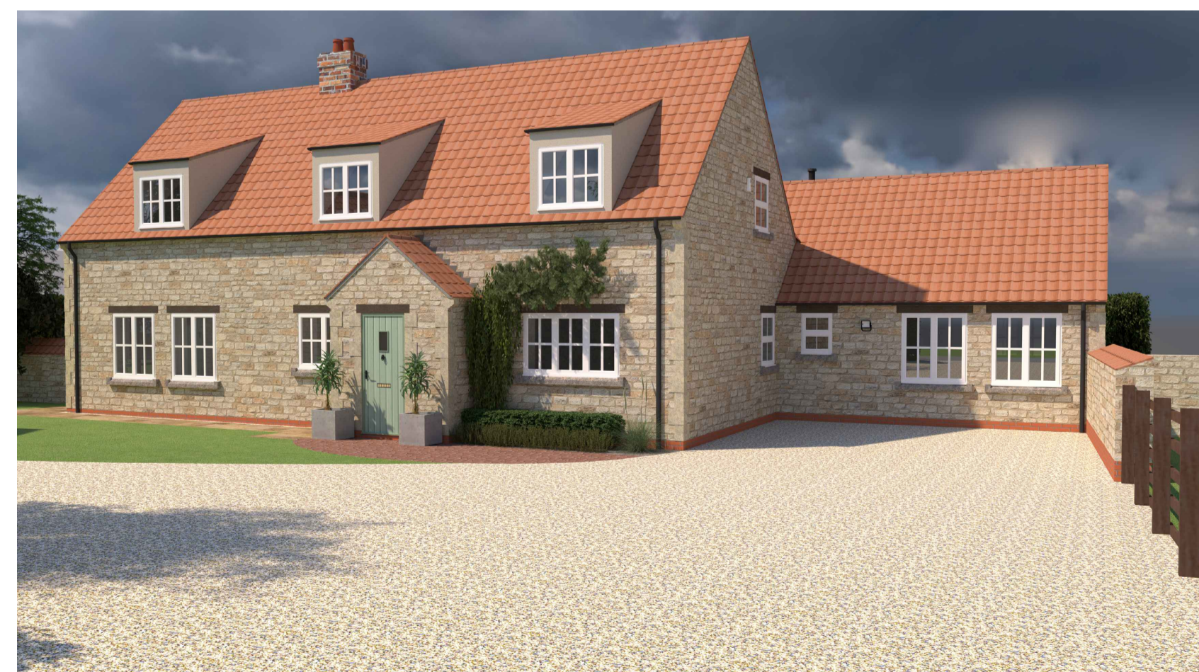
Proposed Visuals (n.t.s)