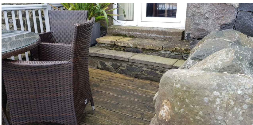
EXISTING PHOTOGRAPH 04