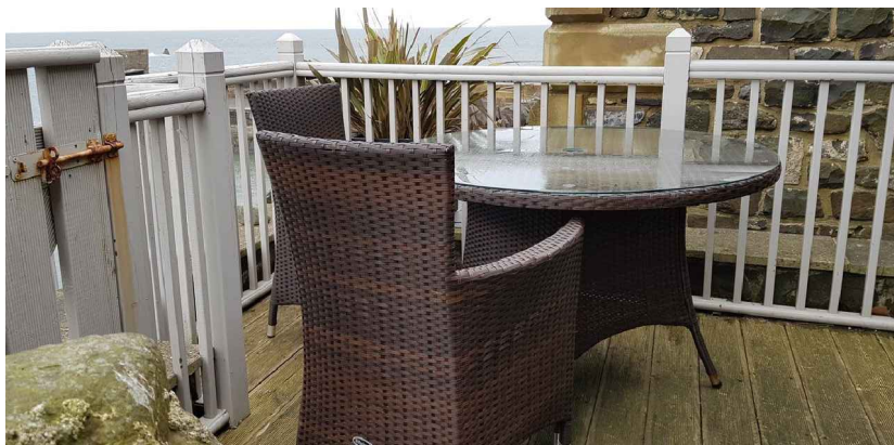
EXISTING PHOTOGRAPH 03