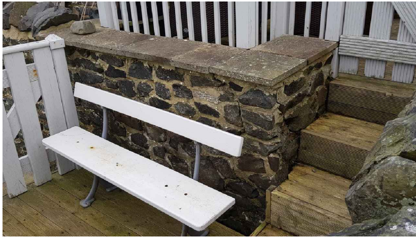
EXISTING PHOTOGRAPH 01