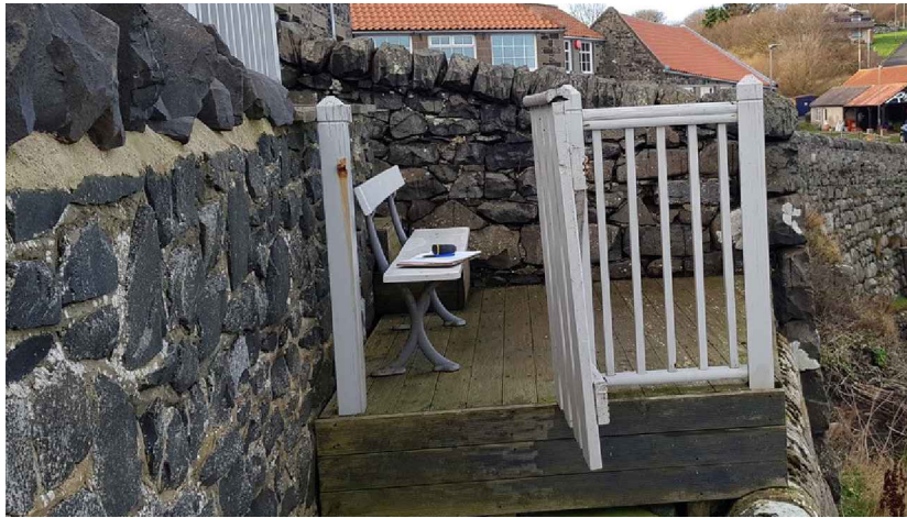
EXISTING PHOTOGRAPH 02