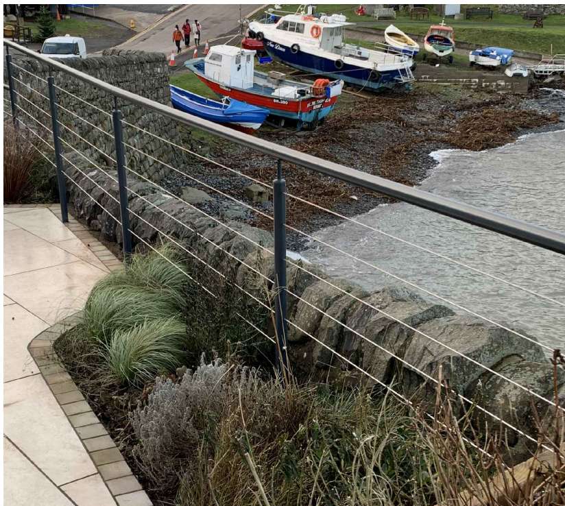
MIDDLE RIGG METAL FENCE