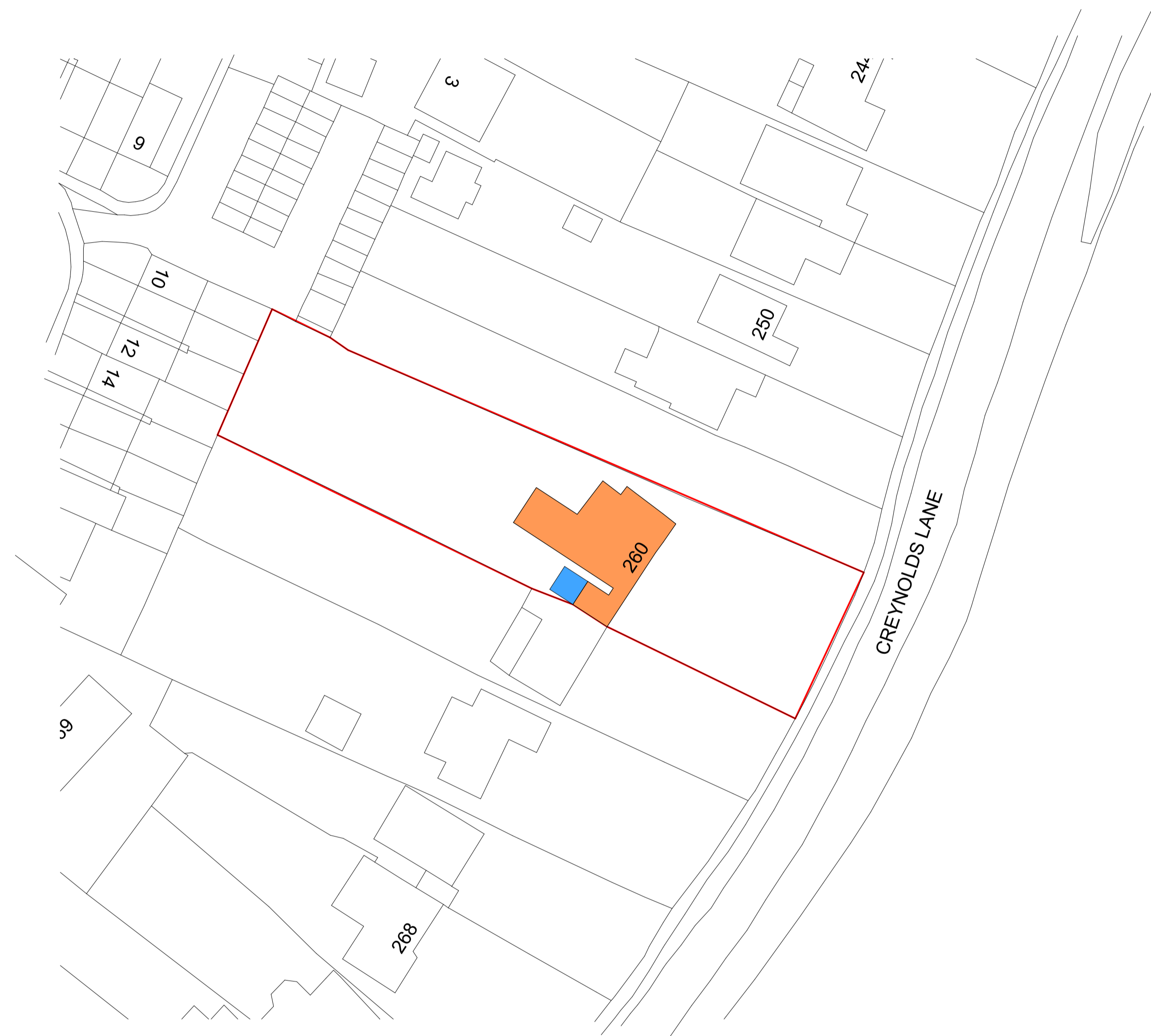
Proposed Site Layout