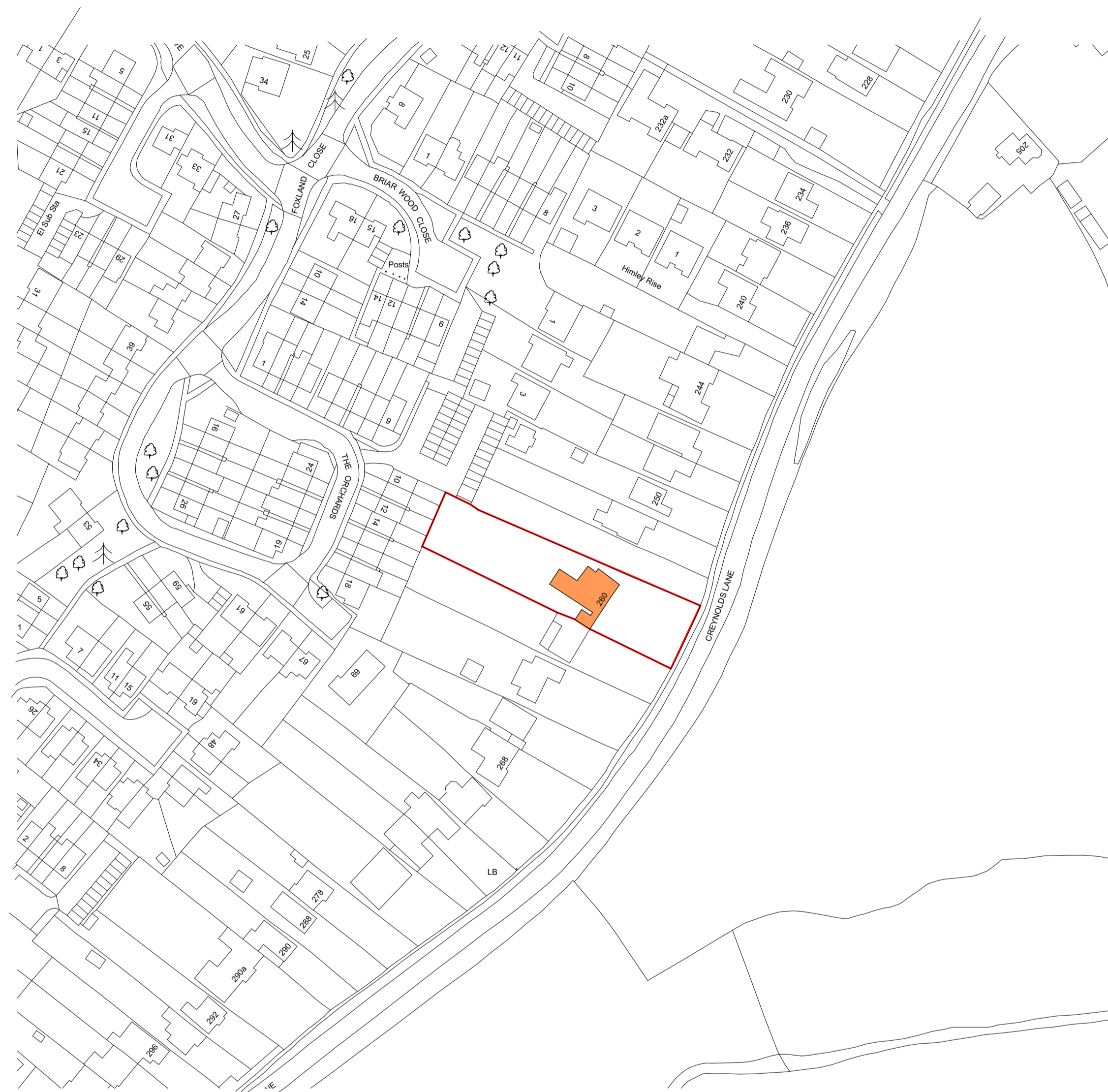
Existing Site Plan