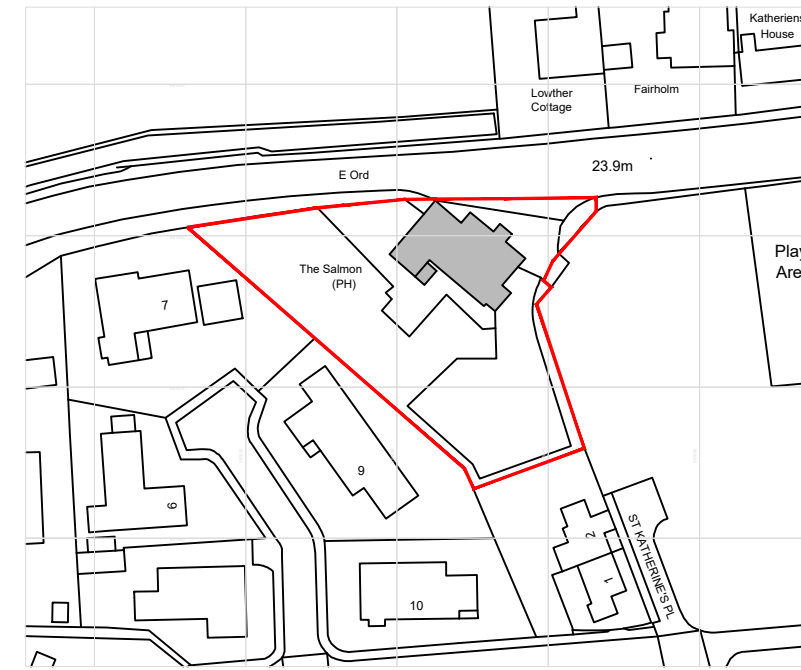
LOCATION PLAN SCALE 1:1250 @ A3