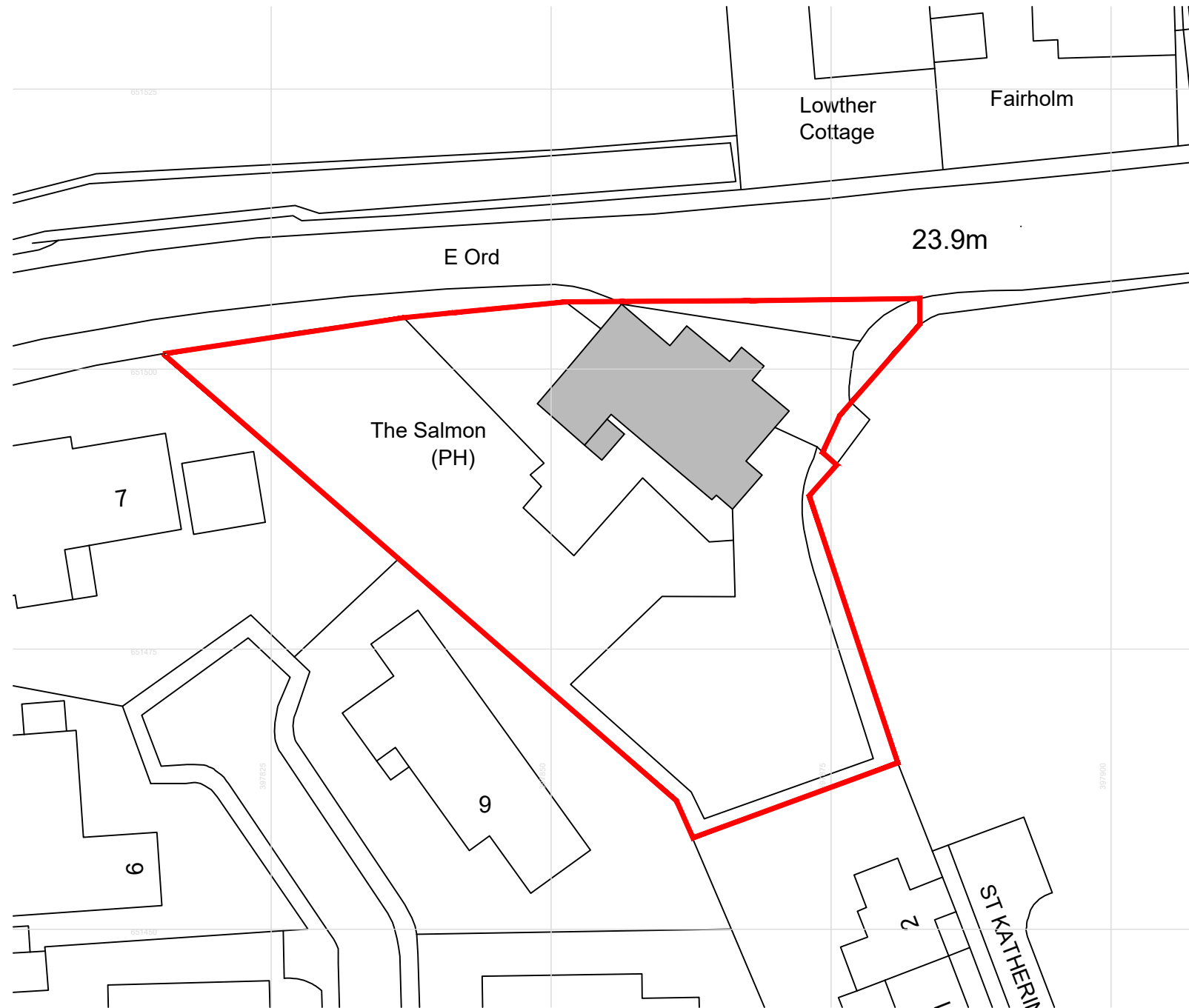
EXISTING SITE PLAN SCALE 1:500 @ A3