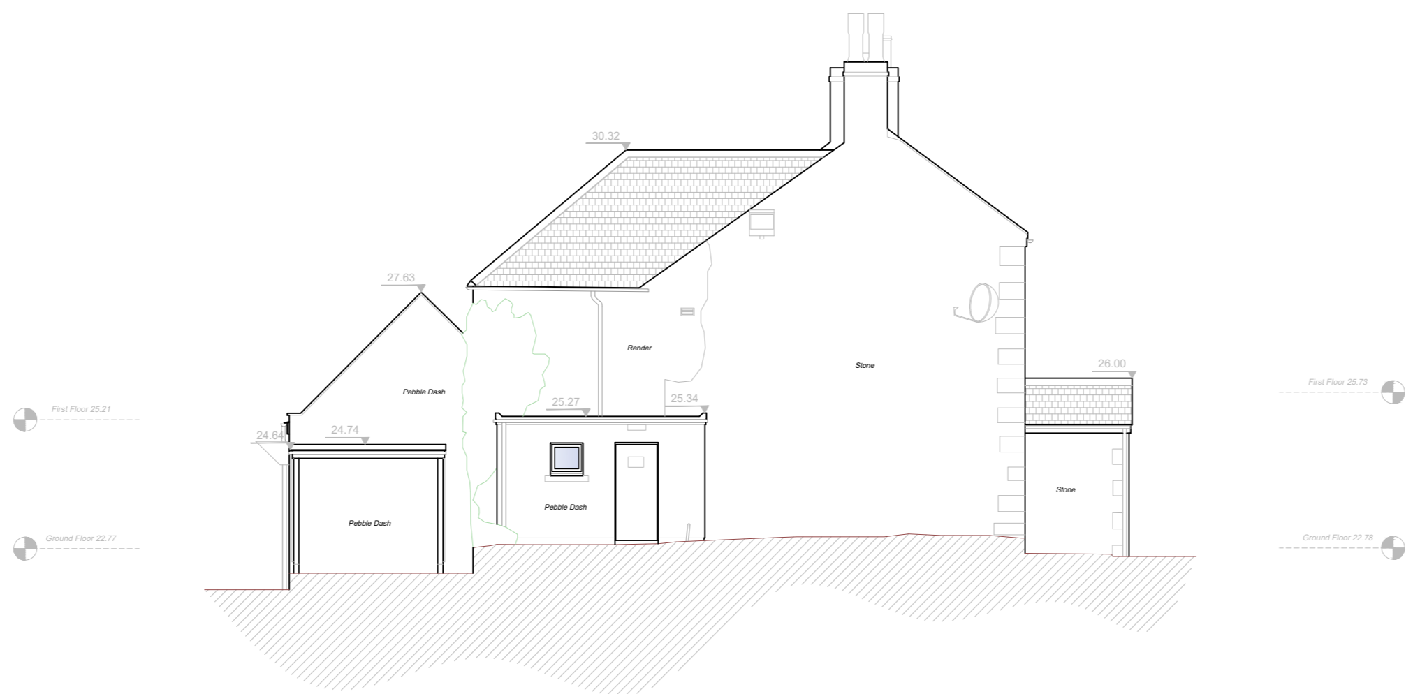
Elevation 4 EXISTING SOUTH EAST ELEVATION SCALE 1:100 @ A2 Datum = 19.00m