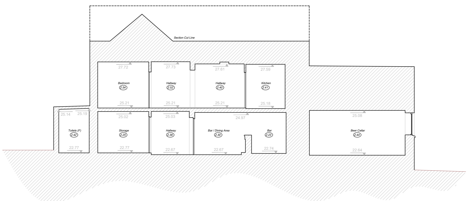
Section A SECTION SCALE 1:100 @ A2 Datum = 19.00m