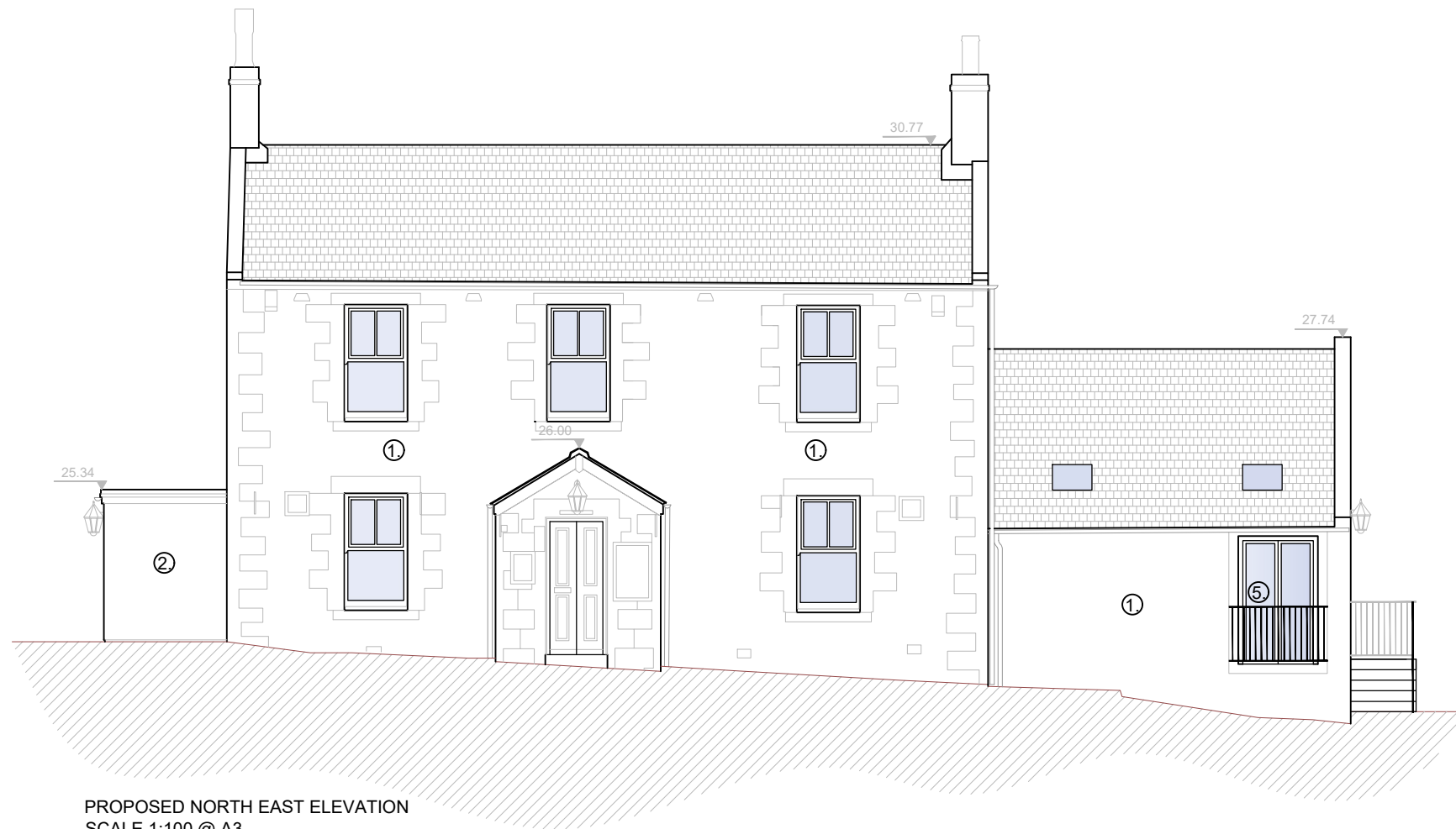
PROPOSED NORTH EAST ELEVATION SCALE 1:100 @ A3