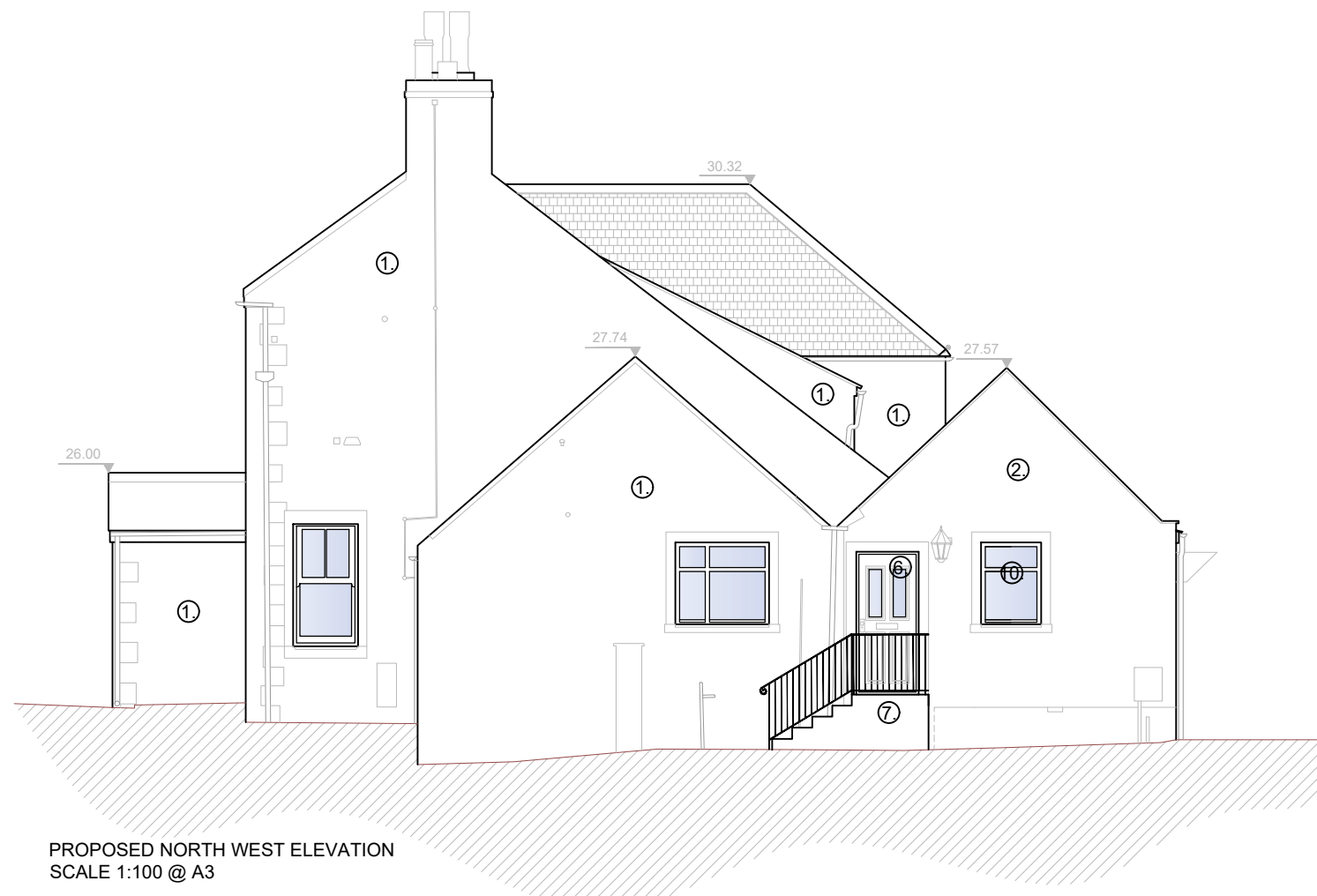
PROPOSED NORTH WEST ELEVATION SCALE 1:100 @ A3