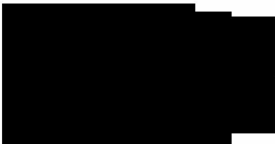
Ian O'Connor Building Control Surveyor